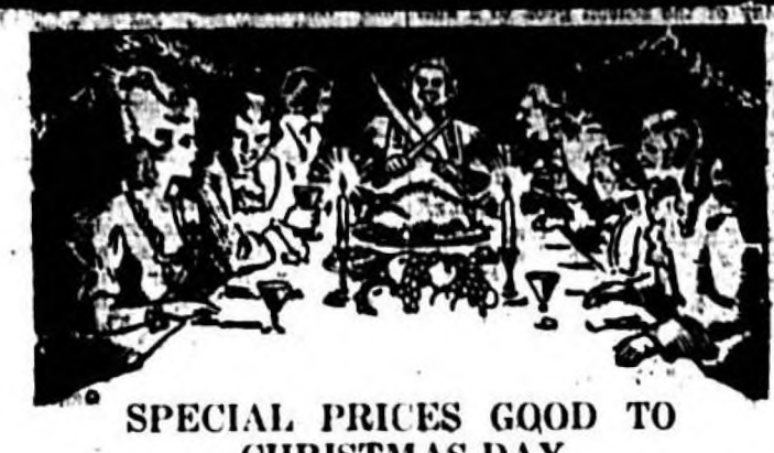
SPECIAL PRICES GOOD TO CHRISTMAS DAY