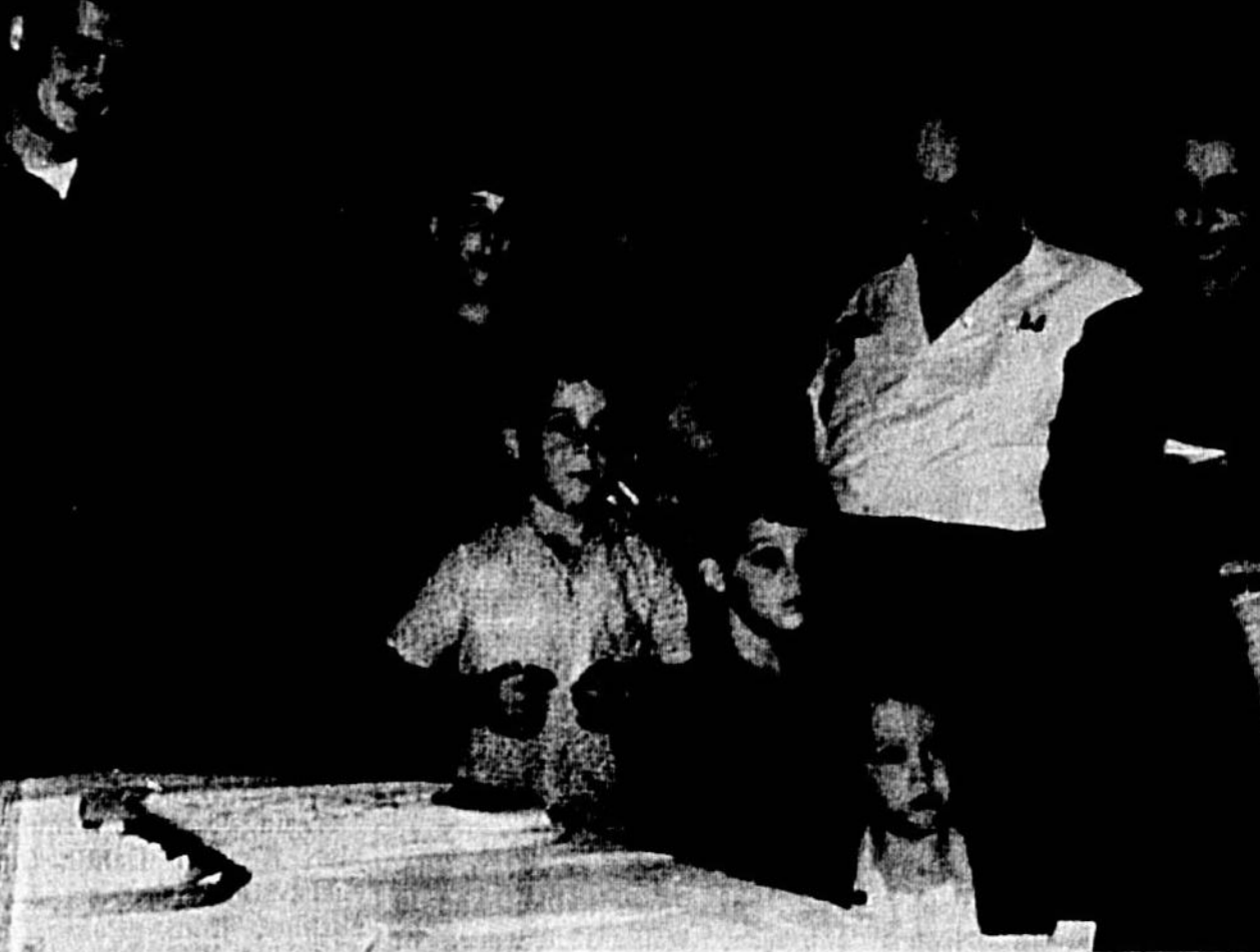
South Seminole Jaycees Drive A Success

Poor Facilities Hit JACKSONVILLE, Fla. (AP)—Negro students were urged to remain at home today to protest segregation and poor dual County school facilities.