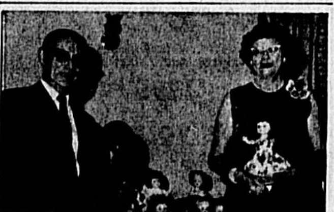
SANFOR ELKS played host to a large group of underprivileged children at the Elks Lodge on Second Street, allowing each child to select several toys from a generous display.