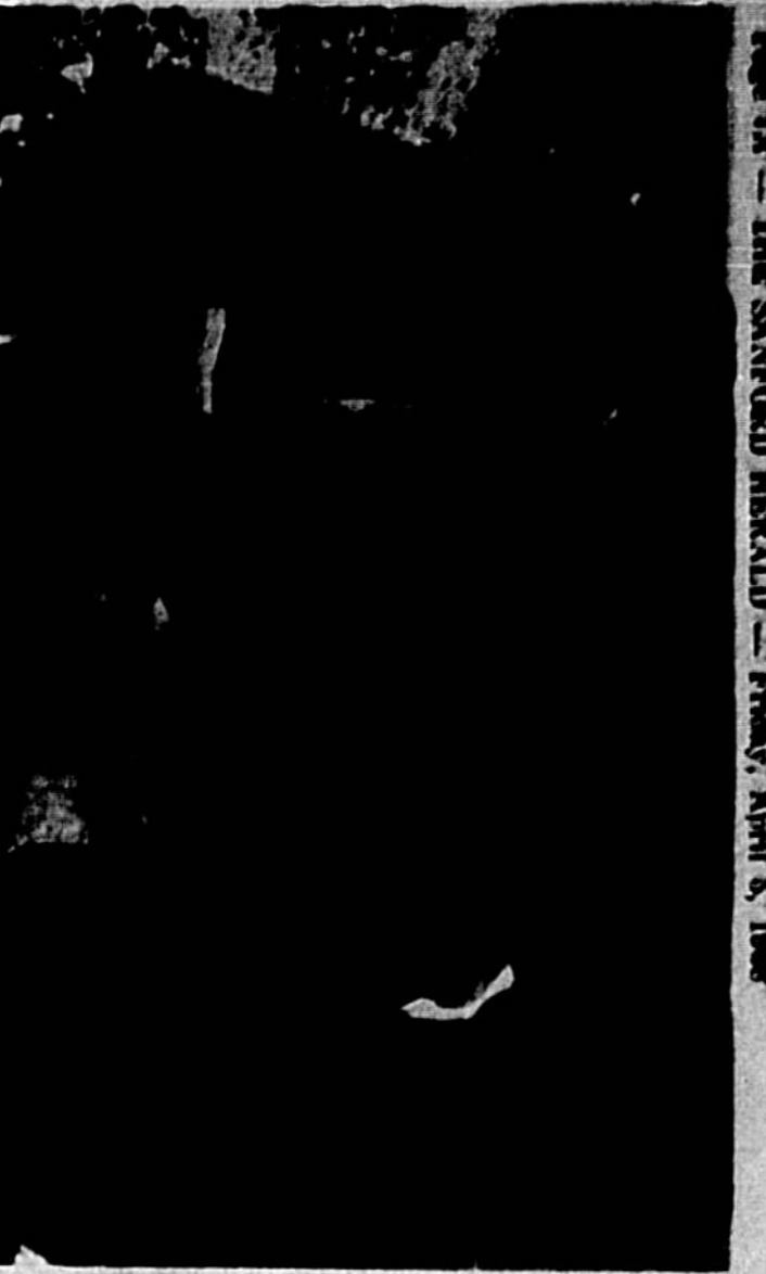
THE LOVELY Mermaids at Weeki Wachee, who double as volunteer fire fighters when they aren't swimming in their underwater Mermaid shows, are always on the look out for dangerous fires in their underwater home.