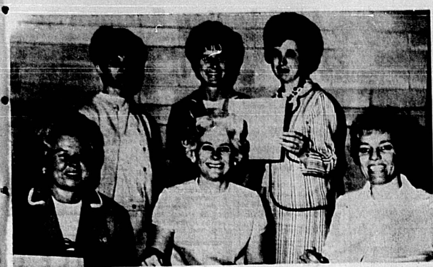
THE ANNUAL LADIES LUNCHEON and Fashion Show, sponsored by the Women's Committee, Central Florida Chapter of the American Institute of Banking will be held on April 6, at Sanford Civic Center...

Some select Sunday as a day of worship, others prefer Friday or Saturday, but the notion of worship knows no boundaries—temporal or spatial.