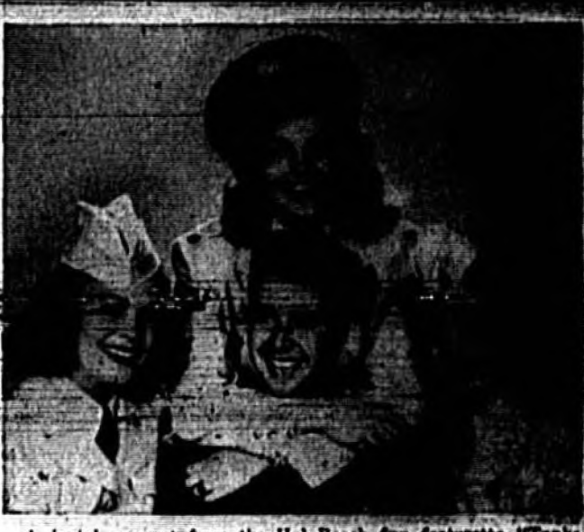
A jovial moment from the Hal Roach fun feature "Baby Face Nelson" featuring William Tracy and Bruce Cabot will be shown as part of a popular Bargain Day-Double Bill Program at the theatre tomorrow, only.

Cliff Melton Gives Braves Second Defeat BOSTON, Apr. 20.—Cliff Melton, the towering southpaw who generally suffers from treatment here because the first New York Giants pitcher to go the distance this season yesterday won his second straight game, 5-2, with a fine hitless performance.