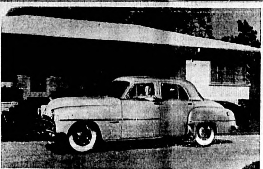
The 1951 Dodge Coronet four-door sedan has a wider windshield and wider rear window for improved driver vision. Bumpers and bumper guards are larger and the grille and hood are of a new modern design.

There are approximately 333,969 Indians living in the United States today.