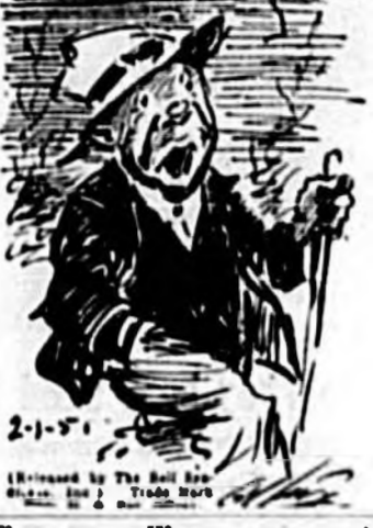
BY HAL BOYLE

O' HIT COS' YOU MONEY WEN YOU BAWN EN COS' YOU MO' T' DIE EN IN BETWIX' YOU WUKS TOO HAND CASE PRICES BE'S SO HIGH!!