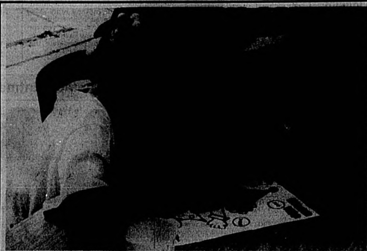
A colorful celebration

Reservations are being requested so that the college can make appropriate arrangements. To make reservations, call Holtgreve at 323-1450, ext. 203 before April 29.