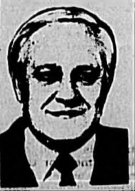
There is only one thing the AARP doesn't disclose to its members: the cost of its advocacy.

The AARP of today is a far different animal. It has an annual budget of more than $300 million, which doesn't include income from its related organizations.