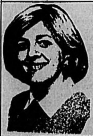
We weren't even allowed time to be simply appalled.

But the truth is that in the book, in the made-for-TV special, in the upcoming documentary, David Koresh has the pivotal role. The president of the United States is just a bit player.