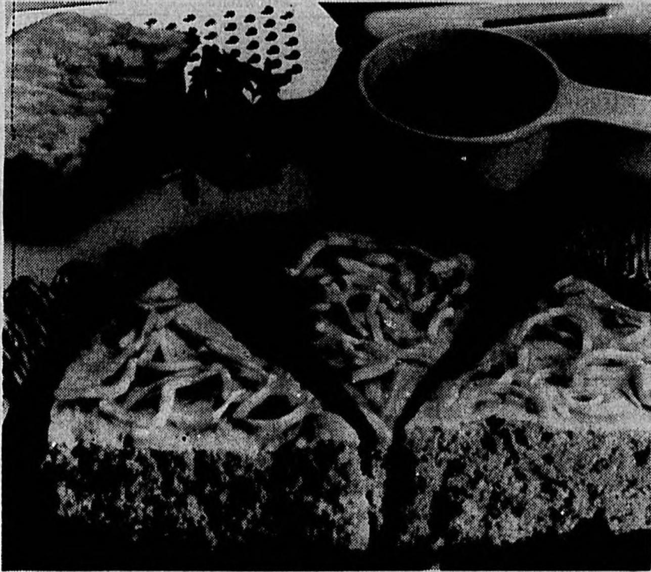
Prepare Cheesy Double-Corn Bread in minutes and reheat in the microwave.