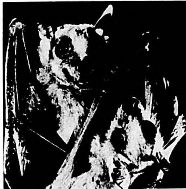
Bats will visit Fun World this weekend.

A video presentation will help educate the public on the positive effect these mysterious creatures have on the environment, on plant and animal life and even on man.