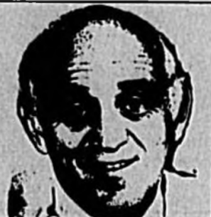
The violent crime rate is obscenely high, the fear rate is way up, and so are tensions between blacks and whites.

Americans want to hear that their president has his priorities straight between the two points of view.