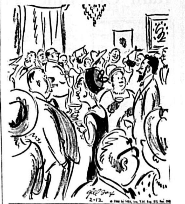
"Oh, I never forget a name, Mr. Face!"