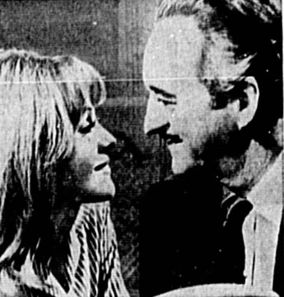
IS FRANCOISE DORLEAC pulling wool over David Niven's eyes in "Where the Spies Are?" The film's suspenseful situations...