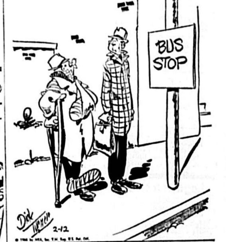
"Careless, Coltspur! Just plain, stupid carelessness! I handed Junior the car keys while standing directly between him and the car!"