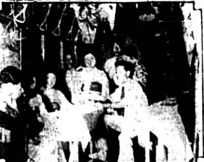
Passengers enjoying the restaurant service provided on Tokyo Hotel electric tramcar.