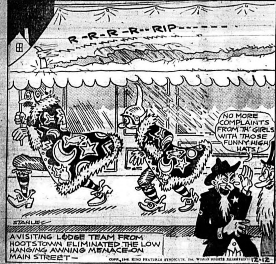
AVISITING LODGE TEAM FROM HOOTSTOWN ELIMINATED THE LOW HANGING AWNING MENACE ON MAIN STREET