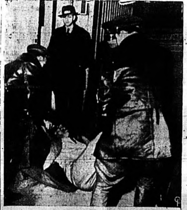
STILL FULL OF FIGHT, this man strenuously objects to his arrest by deputy sheriffs at the strike-bound Aills-Chalmers plant, West Allis, Wis. He is reported by police to have led a mob in an attempt to overturn an auto used by non-striking workers.