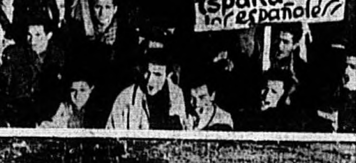
CARRYING PLACARDS, demonstrators (top) stage a rally for Generalissimo Franco in Madrid where he held them that the United Nations had no right to interfere in the internal affairs of Spain. The turnout occurred after proposals had been made before the U. N. to recall ambassadors from Spain until the end of Franco's regime. At bottom are some of the 200,000 persons who gathered at the demonstration.

ATLANTA, Dec. 13.—(AP)—Francisco Franco's answer to the United Nations' demand for an immediate end to the Spanish Civil War is to continue the fight. The Spanish dictator said in a broadcast today that he would not stop fighting until he has won the war.