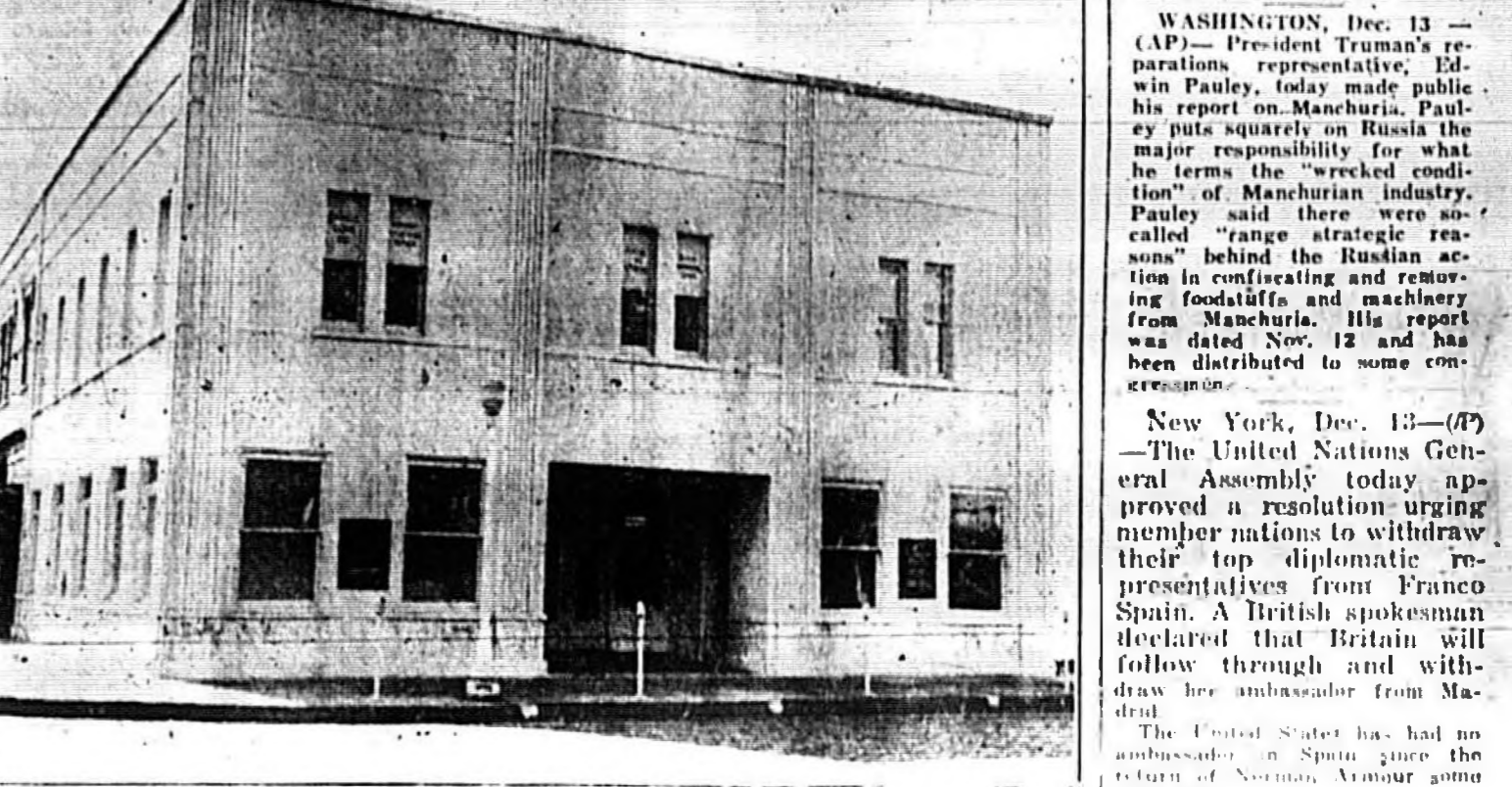
The Florida State Bank building at Park Avenue and First Street is shown as it now appears after it was renovated with a new bank entrance placed with office space on either side, and the old marble exterior replaced by white stucco. The new sign for the front of the bank has not yet been completed.