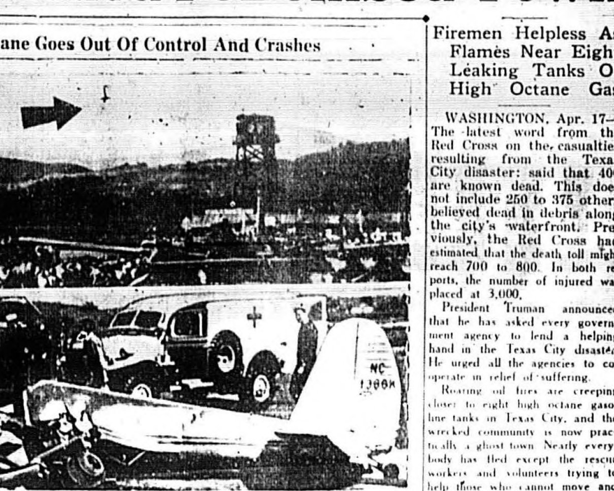
A LIGHT MONOPLANE (ARROW IS SHOWN IN TOP PHOTO) plunging toward the earth in a spiral of 3,000 feet as it was destroyed in the Texas City disaster. The plane is pictured in motion after the fatal crash. It went out of control and hit the ground at the mouth end of the field runway.

ATHENS, Apr. 17.—Romania's Greek army operations against guerrillas in northern Greece have escaped a trap by filtering through government troops during the night.