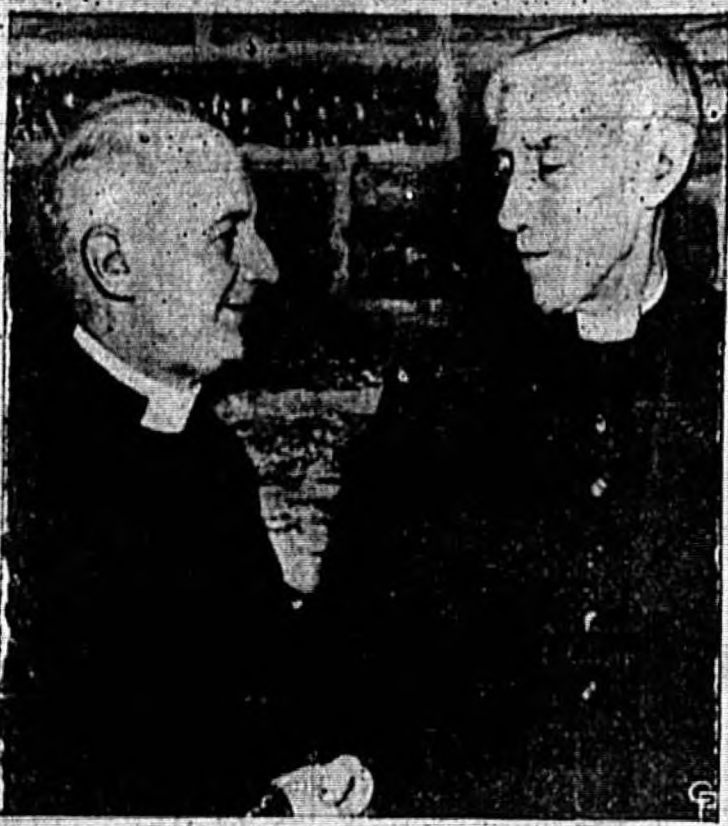
NAMED PRESIDING BISHOP of the Episcopal Church in the United States, the Rt. Rev. Henry Knox Sherrill (left), bishop of Massachusetts, is congratulated in Philadelphia by Rt. Rev. Henry St. George Tucker, bishop of Richmond, Va., retiring after 9 years service.

TURN IN MORE USED FATS GET 4¢ FOR EVERY POUND