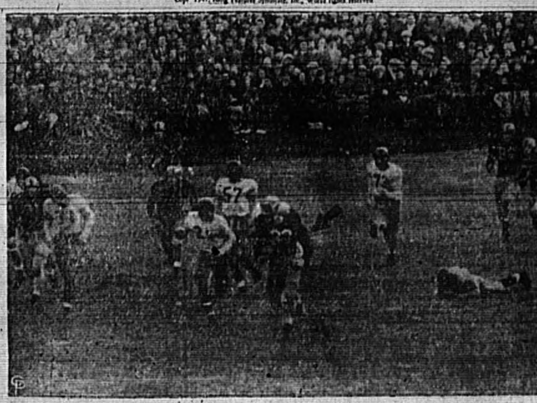
IN ONE OF THE MOST SENSATIONAL field runs in the history of big league army a Rowan (33), shown in center of picture, goes down the field for the 92-yard run which gave Army a next start in its relatively easy victory over Navy at Philadelphia; Navy had bad breaks in the first half, but the West Pointers didn't have to work too hard in the second half for their 21-0 score.