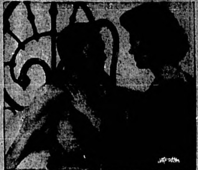
PAUL NEWMAN and Alexis Smith are the love team in "The Young Philadelphians" coming to the Movieland Drive-In Sunday. Newman plays a lawyer who overcomes the social obstacles along the Main Line.

LAGUNA BEACH, Calif. (UPI) — Jack Norworth, musical composer and composer of such songs as "Take Me Out to the Ball Game" and "Swing On It, Harlem Moon," died Tuesday night at the age of 71. He had been recovering from a stroke and other ailments.