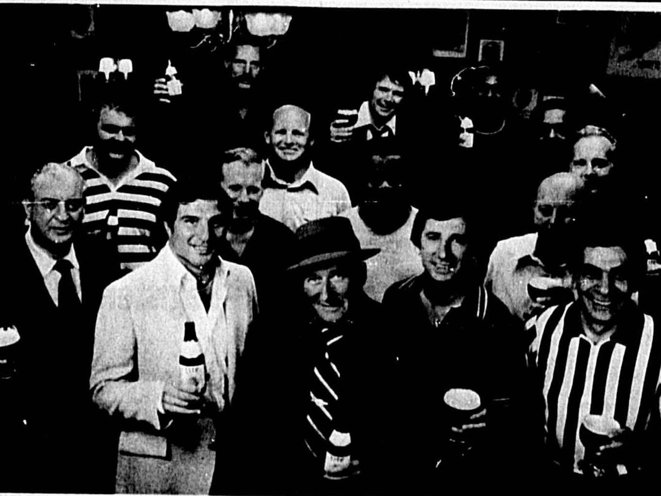
WHEN YOU SAY BEER... These famous personalities are participating in one of America's favorite sports — beer drinking. The group was gathered for a television commercial in New York. Greats from the sports field, plus comedian Rodney Dangerfield and mystery author Mickey Spillane make up the field. Do you need a scorecard to guess the lineup? If so, see below.