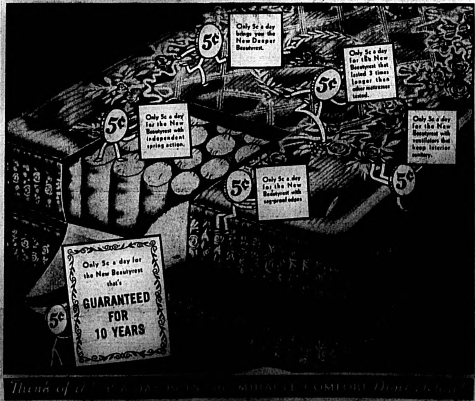
Think of a Beautyrest as a permanent investment in your comfort.