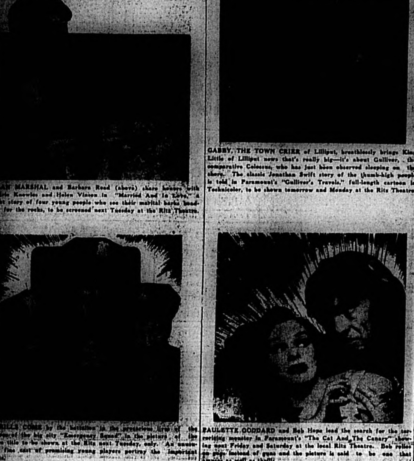
GABBY, THE TOWN CRIER of Lilliput, breathlessly brings King Little of Lilliput news that's really big—it's about Gulliver, the cooperative Colossus, who has just been observed sleeping on the shore. The classic Jonathan Swift story of the thumb-high people is told in Paramount's "Gulliver's Travels," full-length cartoon in Technicolor, to be shown tomorrow and Monday at the Ritz Theatre.