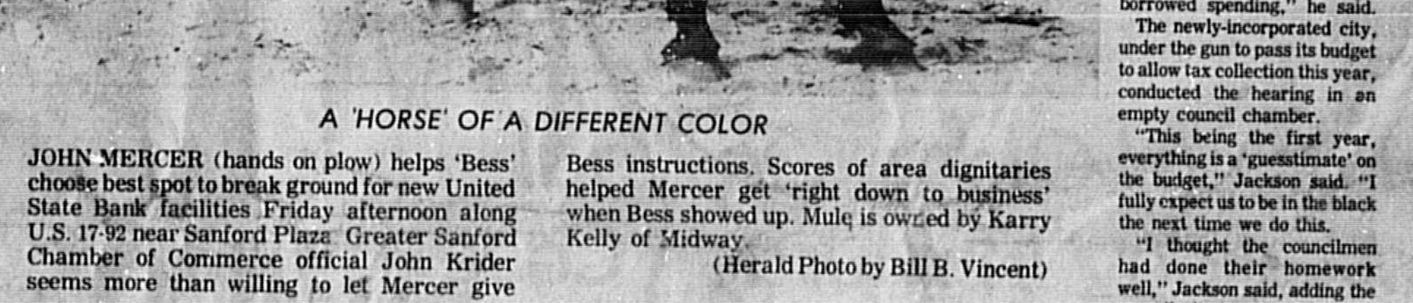
A 'HORSE' OF A DIFFERENT COLOR

LAKE MARY — City Council Friday passed its $147,292 budget for the coming year without any changes after a 15-minute public hearing.