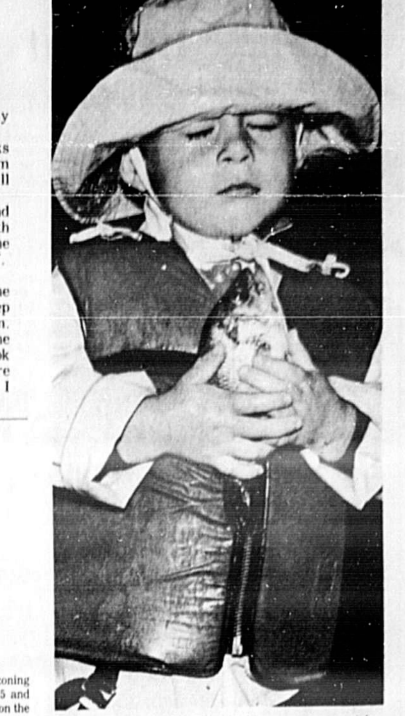
"CAUGHT IT BY MYSELF." This youngster must be thinking at the annual 1000 Islands Children's Fishing Derby at Alexandria Bay, N.Y.