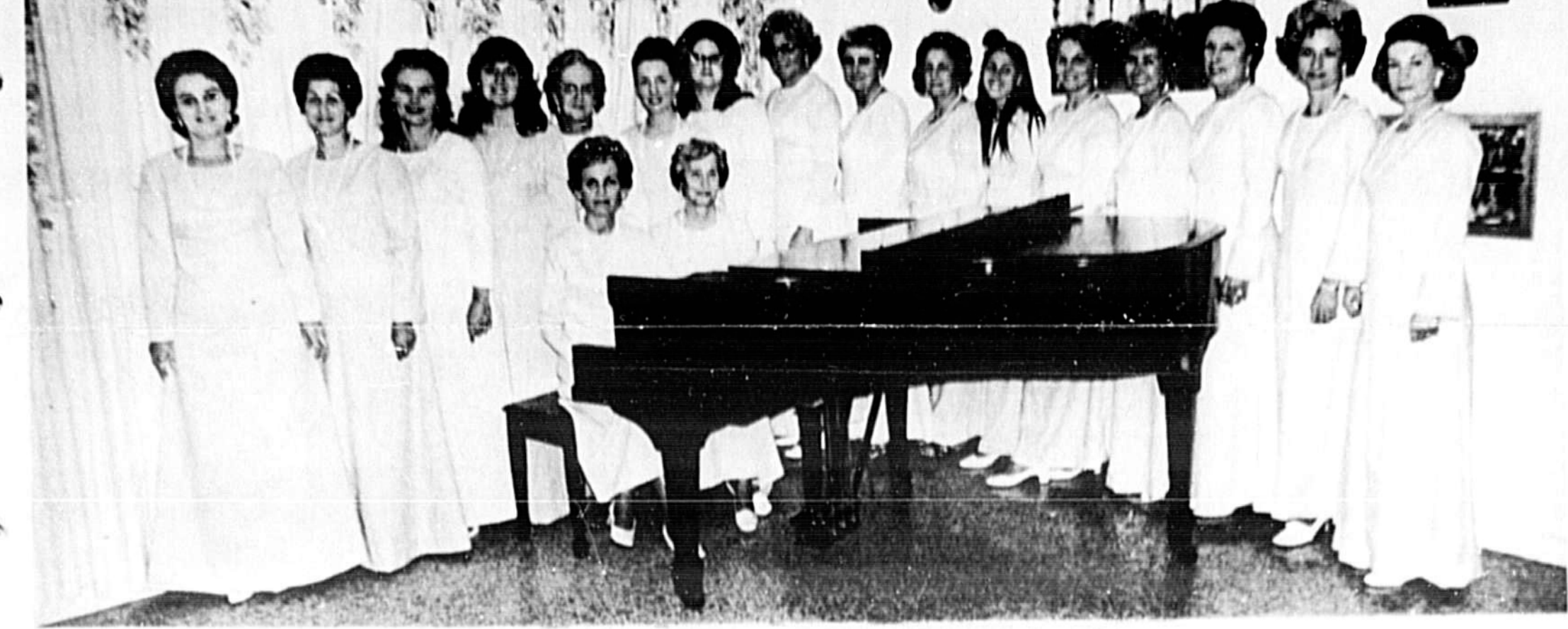
Getting In Tune For Doctor's Day

4 BIG LOCATIONS THE REMNANT SHOP NO. 3 AZALEA PARK, ORLANDO 251 EAST MICHIGAN, ORLANDO 3796 W. COLONIAL, ORLANDO HWY. 17 & 92 NEAR MAITLAND IN FERN PARK SHOP OUR STORE NEAR YOU!