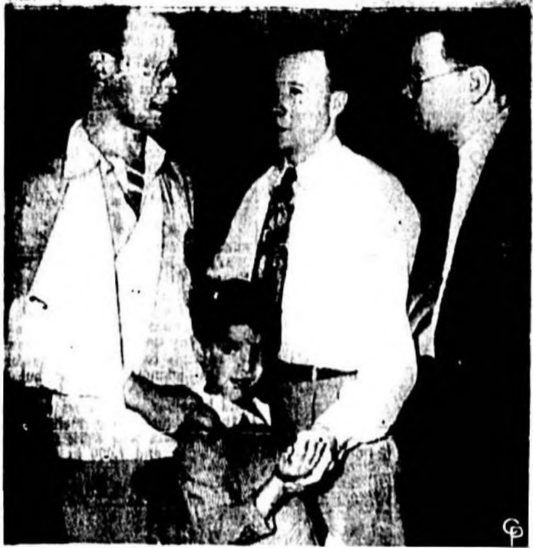
FOLLOWING HIS SPEECH to the CIO and all Communist dominated unions... International Union of Marine and Shipbuilding Workers of America.