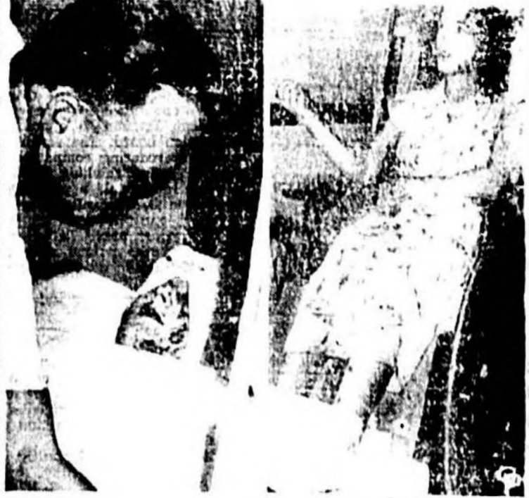
HOSYESS about the ill-fated 1948 election... she was taken.