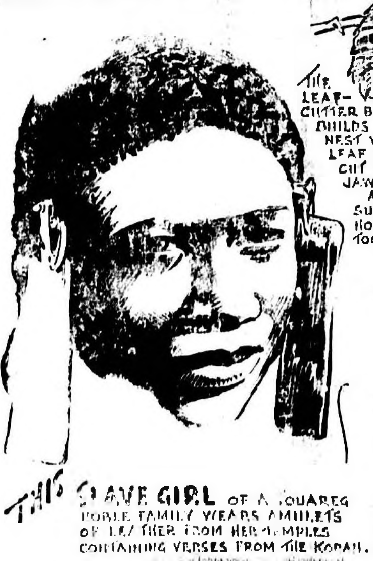
THIS SLAVE GIRL OF A SOUREG HOME, FAMILY WEARS AMULETS OF LEAF FROM HER MOTHER CONTAINING VERSES FROM THE KORAN.