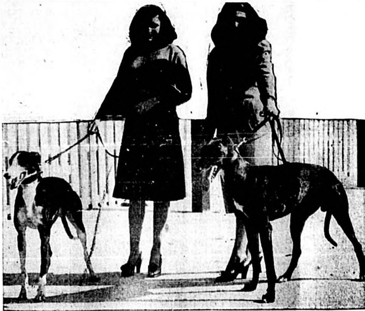
Two of the sleek, streamlined greyhounds, such as those who nightly set a fast pace at races at the Sanford-Orlando Kennel Club's track at Longwood, are shown being given a bit of outdoor exercise by two of the sleek, streamlined greyhounds, such as those who nightly

2-27-48