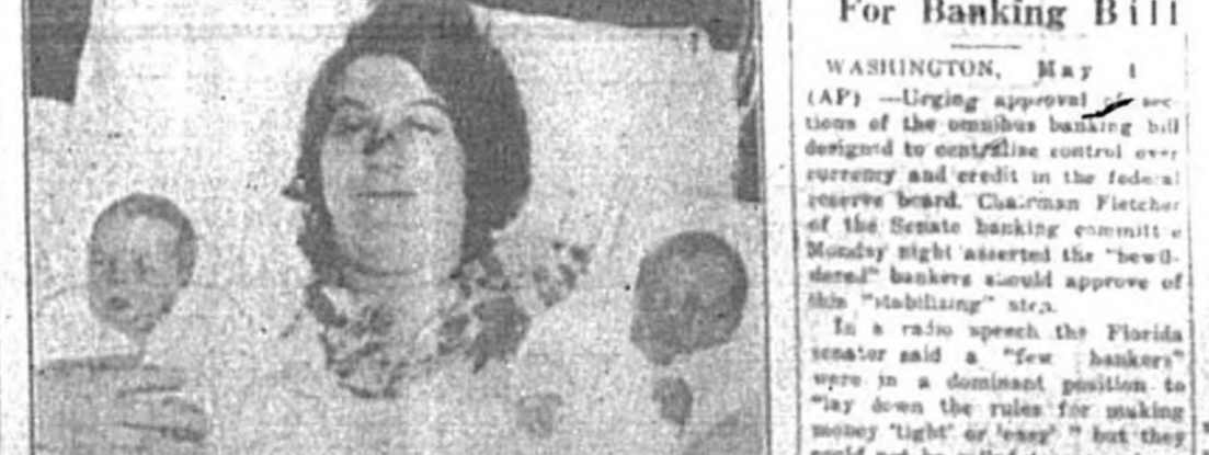
The Dionne twins, who were born to a woman in Ontario, Canada, are shown in a photograph.