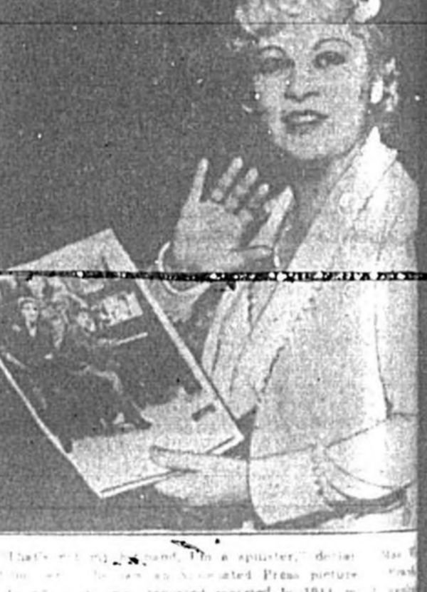
The woman in the photograph is the subject of a story titled 'Not My Husband,' which details her experiences.