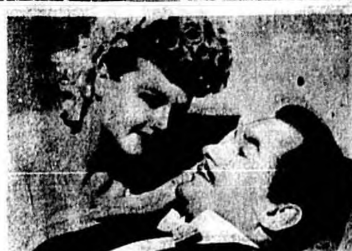
Angela Lunabury can't resist suave George Sanders in this scene from 'The Private Affairs of Bel Ami' with Ann Dvorak, presented Tuesday and Wednesday on the Ritz Theatre screen.