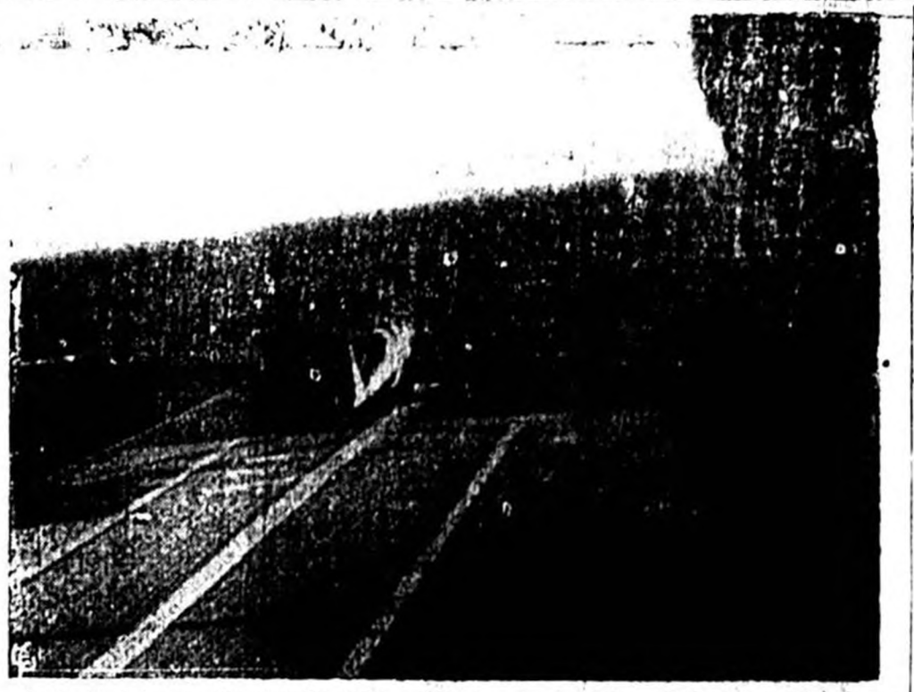
From the deck of a Japanese aircraft carrier a Japanese bomber takes off for the attack on Pearl Harbor, on December 7, the day of infamy. Taken from a captured Japanese aircraft, this picture of the beginning of the invasion of Hawaii is released through the OWI.

New York, May 7. (AP) - Figures showing a decided drop in withdrawals of domestic distilled spirits from storage and a large increase in the withdrawal of beer are expected to become more pronounced as liquor shortages become more acute and rationing is extended from the schedule to the consumer level.