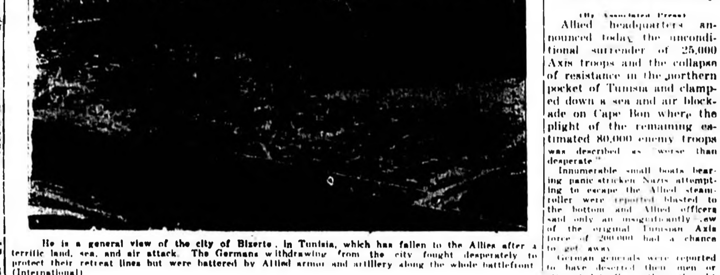
It is a general view of the city of Bizerte, in Tunisia, which has fallen to the Allies after a terrific land, sea, and air attack. The Germans withdrawing from the city fought desperately to protect their retreat lines but were battered by Allied armor and artillery along the whole battlefield.