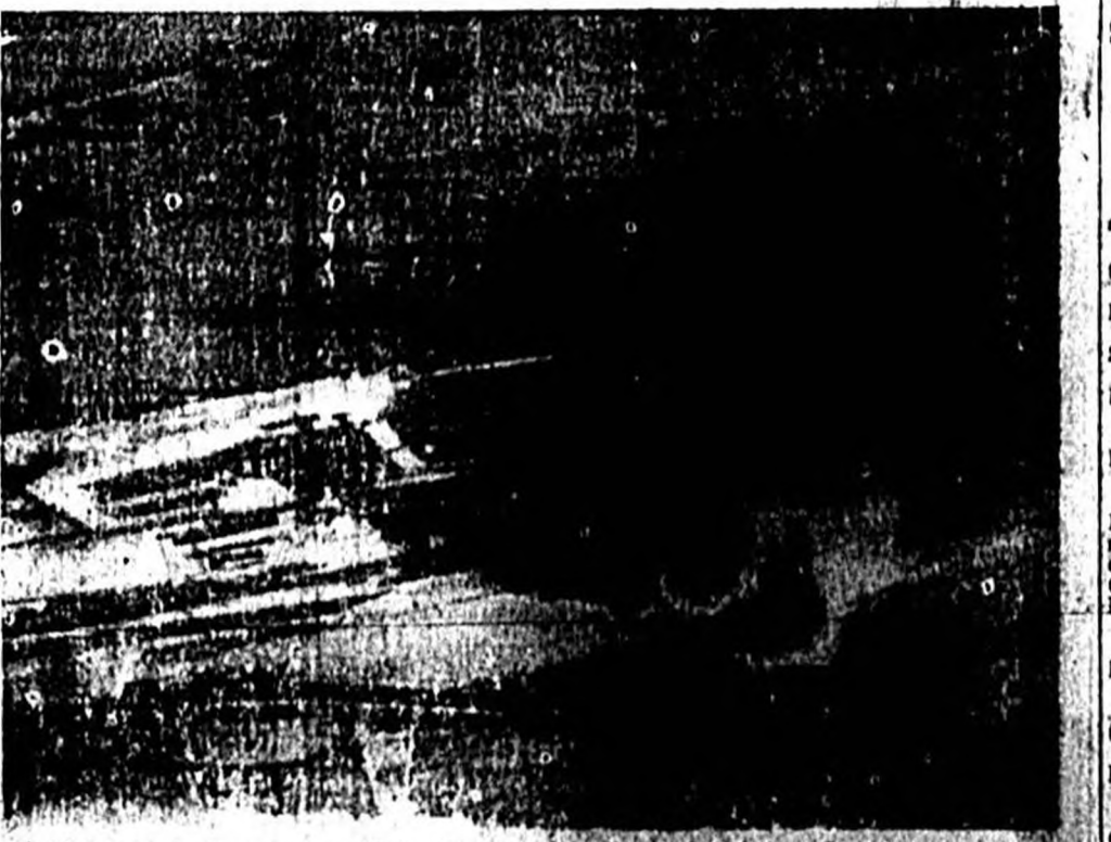
A picture made from a Japanese bombing plane shows American defenders of 'The Rock' Corregidor filling out of the tunnel in which they had lived for weeks under the Jap attack. Lack of water and food and mounting gas fumes forced their capitulation.