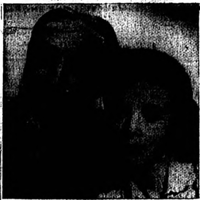
Monte Woolley and Ida Lupino in their latest 20th Century Fox picture, "LIFE BEGINS AT EIGHT-THIRTY," from the hilarious Broadway stage play, will be seen at The RITZ THEATRE today and Thursday.