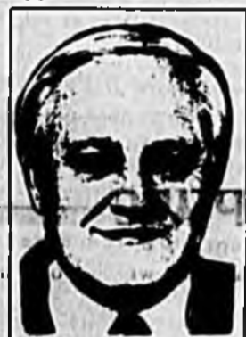
A charge the White House and Park Service now vehemently deny.