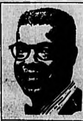
Clinton's pandering played well.

Violence, graffiti scrawled on Japanese-American-occupied buildings, firebombings, property destruction and face-to-face humiliations have escalated in hateful intensity during the last few months, especially in California.