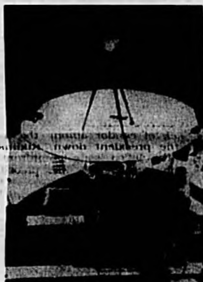
PIONEER 10, which originally weighed 870 pounds, has a 9-foot dish antenna with booms. Here the space probe is being readied for a test little more than a month before its eventual launch on March 2, 1972.

NASA would like to maintain the signals until Pioneer 10 breaks through the heliosphere toward the stars. But no one knows when that will be. The heliosphere expands and contracts over the millennia, and though it is pulling back currently, the vehicle may yet have to plow through many miles and years.