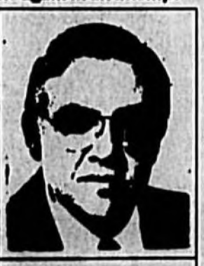
Those congressmen involved might be guilty of serious felonies.