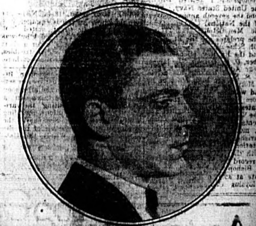
George White, Producer of George White's Scandals

Said Flo Brooks to Lou Holtz while waiting for their cue to appear in "Manhattan Mary."