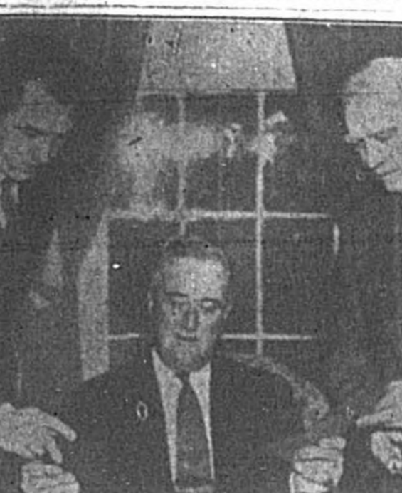
In common with small boys and most of the grown-ups, too, Fredrick Roosevelt thought no turn to baseball!