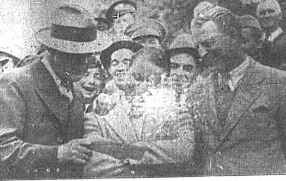
There was reason aplenty for the broad smile Gene Sarazen (center) displayed when this picture was made...