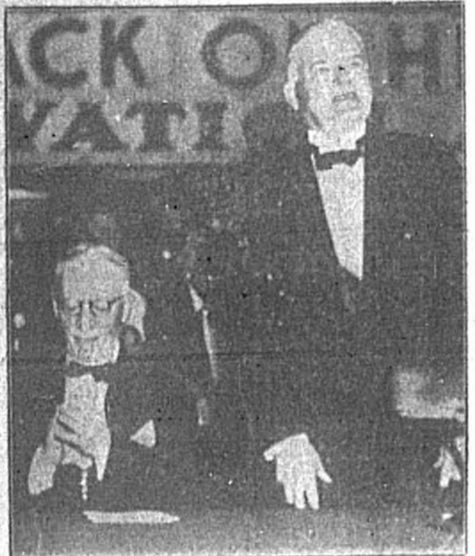
Only seven years ago History...