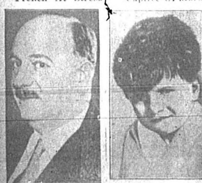
Believing he is still alive in the hands of a mob...