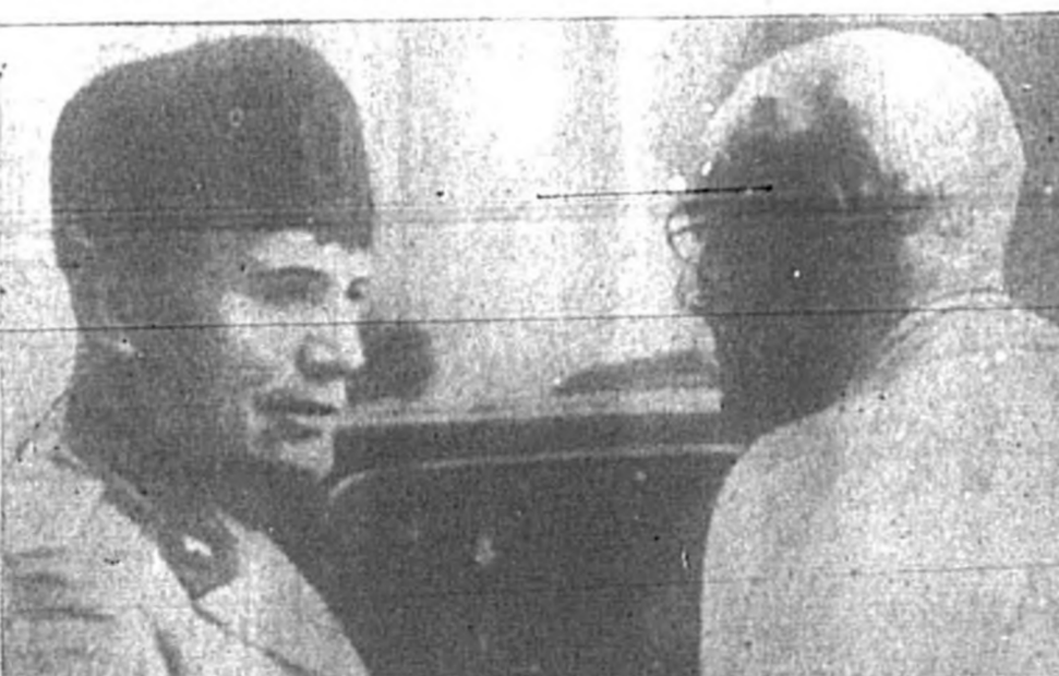
Premier Mussolini (left) of Italy and Prime Minister Ramsay MacDonald of Great Britain...