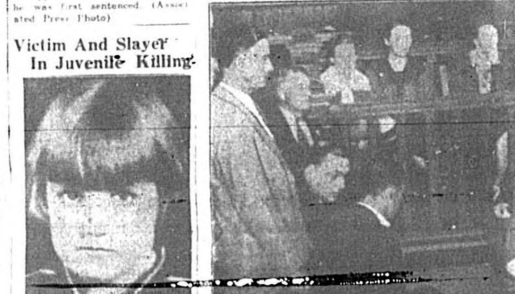
Bloodhounds were called out at Camden, S. C....