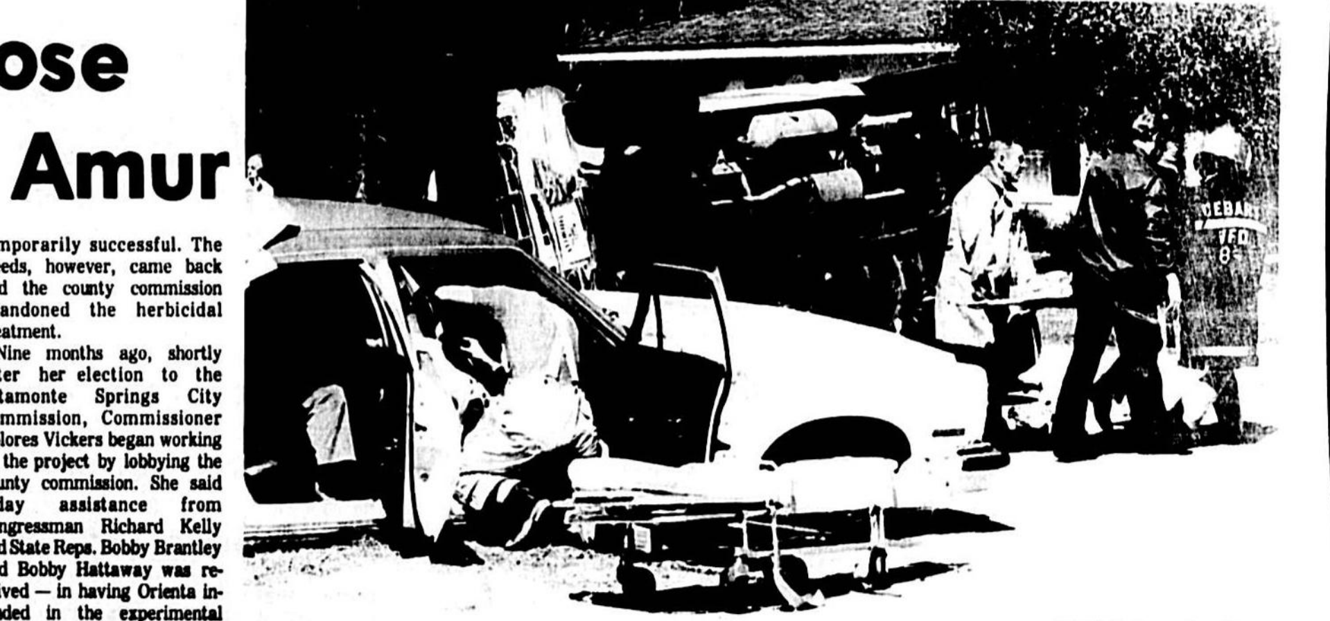
WOMAN TRAPPED 45 MINUTES

By DONNA ESTES Herald Staff Writer Thousands of white amur, the weed-gobbling fish native to Russia, were dumped into the Oriente in Altamonte Springs Wednesday, as a first step in saving that dying lake.