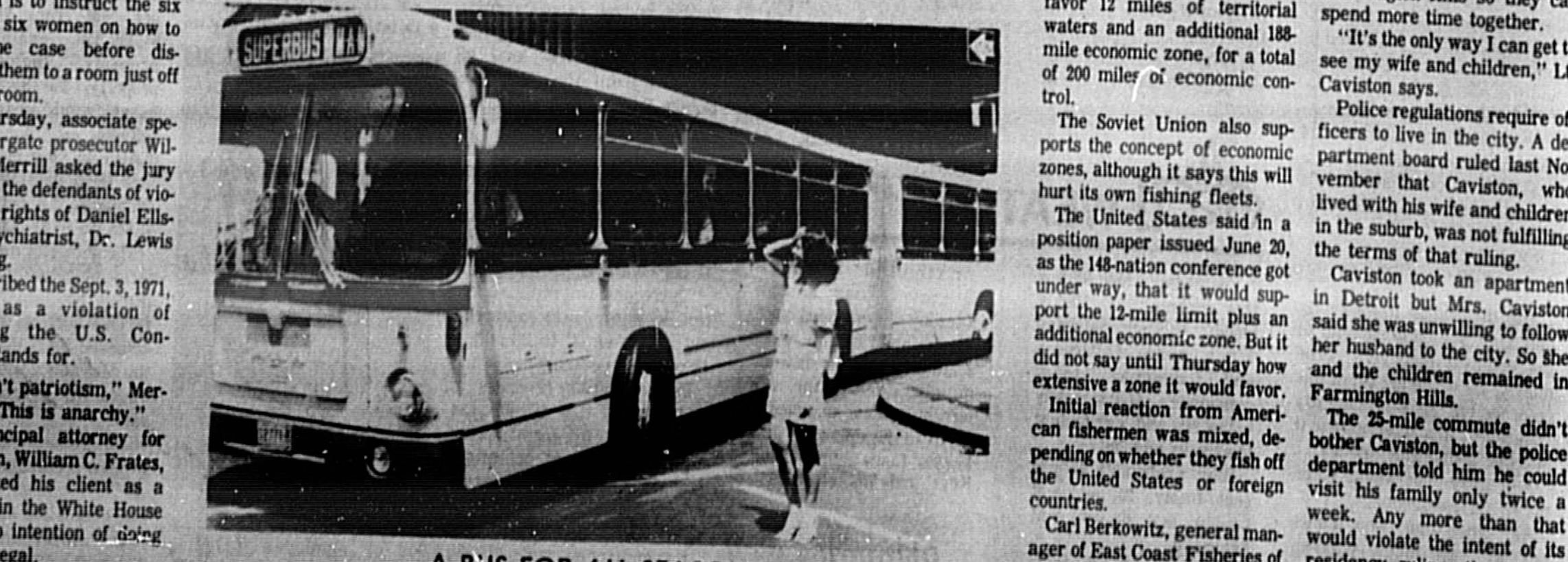
A BJS FOR ALL SEASONS BENDING BUS startles passengers in New York when this German-produced specialty executes a turn-and-a-half at intersections.