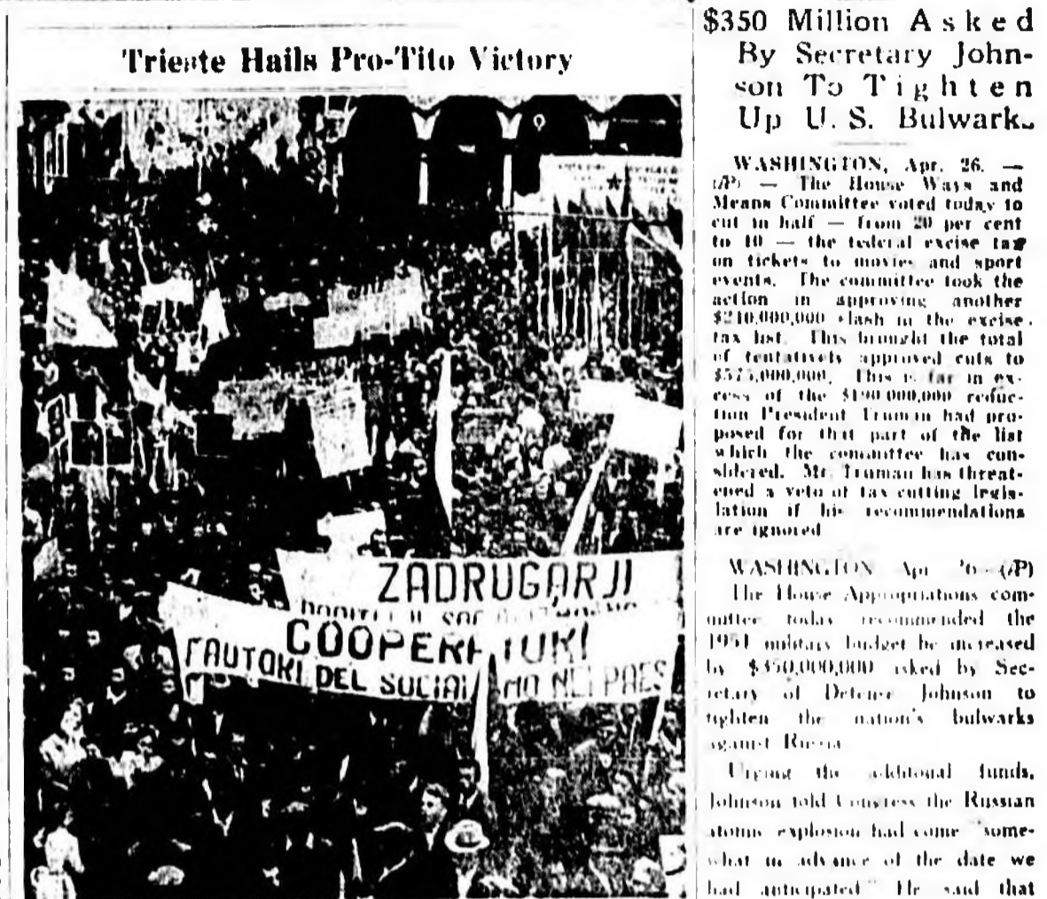
THROUGH THE STREETS OF TRIESTE, march thousands of celebrant victory in the Yugoslav-occupied zone of the Free Territory. Two regional councils were chosen by the voters.

TOWNSEND CLUB The Townsend Club will meet at the Tourist Center Friday at 8:00 P. M. Everyone is invited and refreshments will be served.