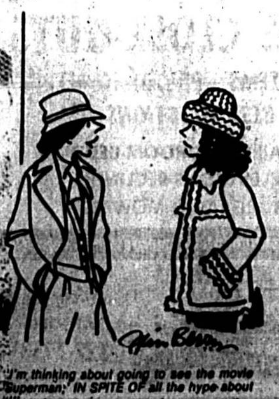
...I'm thinking about going to see the movie 'Superman' IN SPITE OF all the hype about...