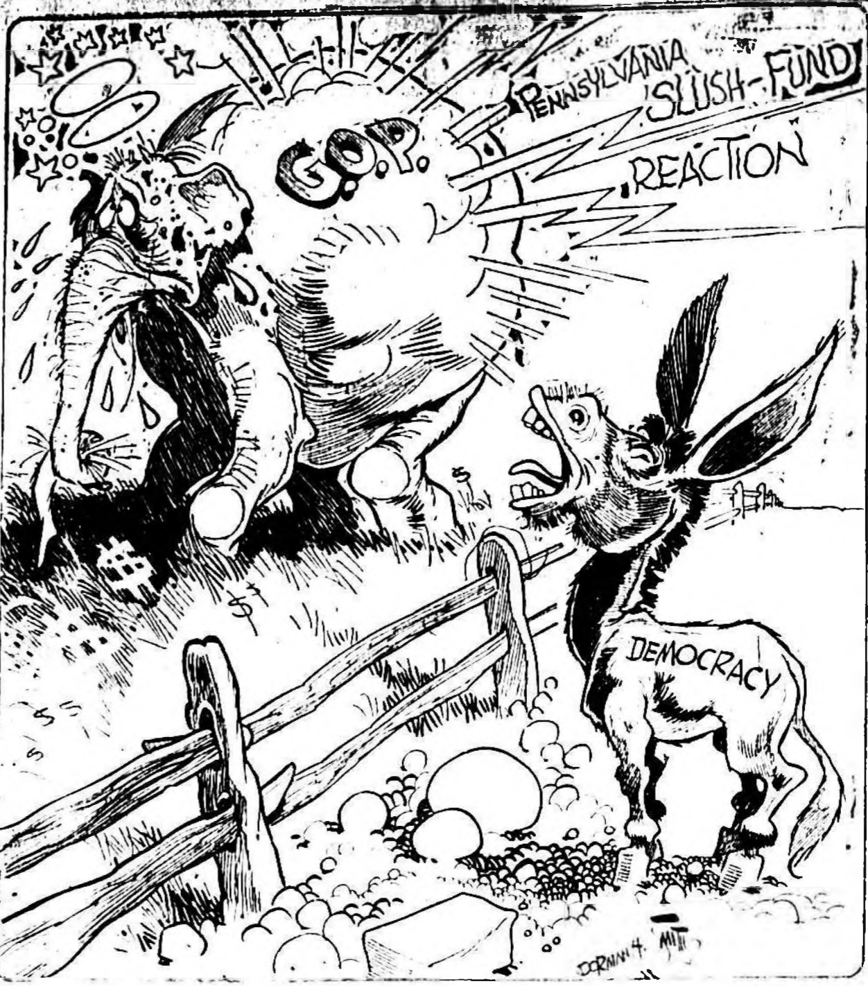
"FRONT PAGE STUFF" UNITED STATES PUBLISHER

An editorial on "Front Page Stuff" as it is now done. The "Front Page Stuff" is the one thing that is now done. The "Front Page Stuff" is the one thing that is now done. The "Front Page Stuff" is the one thing that is now done.