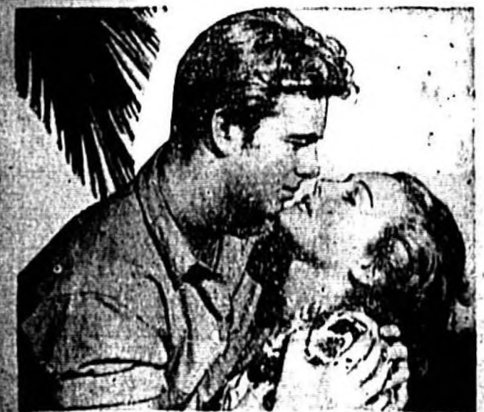
STIRLING HAYDEN and Madeleine Carroll, starred in "Bahama Passage," the beautiful technicolor film dealing with the story of a murder, madness and a maid, will be the feature attraction at the Ritz Theater tomorrow and Monday. A fine supporting cast adds much to the film.