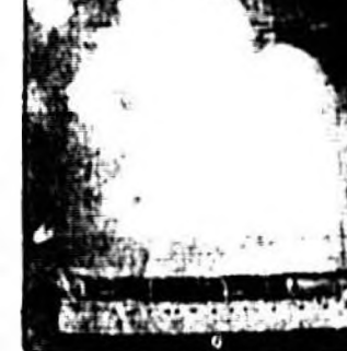
These ships and eight others were lost by the United Nations forces in the sea battle with the Japanese off the coast of Java.