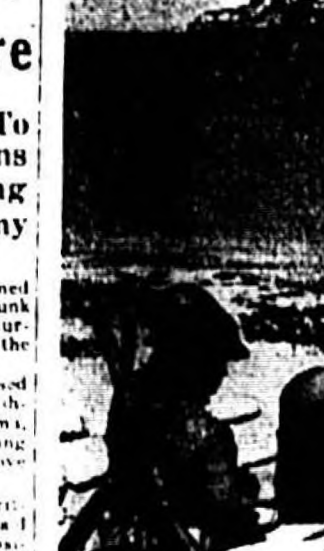
United States military planes are on alert at Puerto Rico.