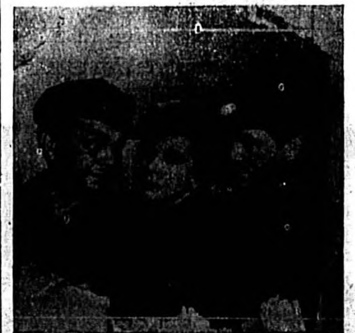
A GREAT CAST headed by Edward G. Robinson, Ida Lupino and John Garfield will be seen next Tuesday at the local Ritz, when "The Sea Wolf," Jack London's great adventure story hits the local screen.