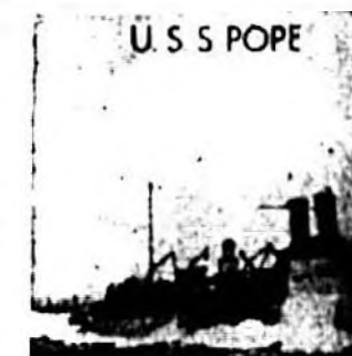
These Ships Lost By Allies In Java Sea Battle