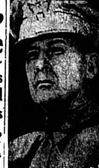
General Douglas MacArthur, who has arrived in Australia to assume the United Nations Command in the Far Pacific.