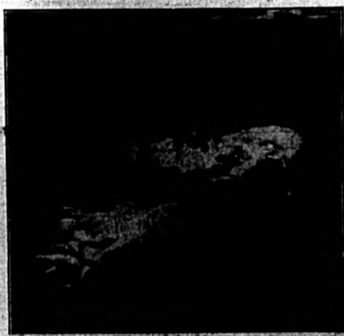
Shortly after this picture was taken by a coast guard plane stranding low over the wreckage of the freighter Iowa on Peacock Spit, a few stars hit the north Pacific ocean, stopped patrols from recovering the bodies of the victims, and threatened Oregon coastal towns. The entire crew of 36 perished, and many bodies were believed entombed in the vessel when the Iowa was dashed against by raging ocean storms.