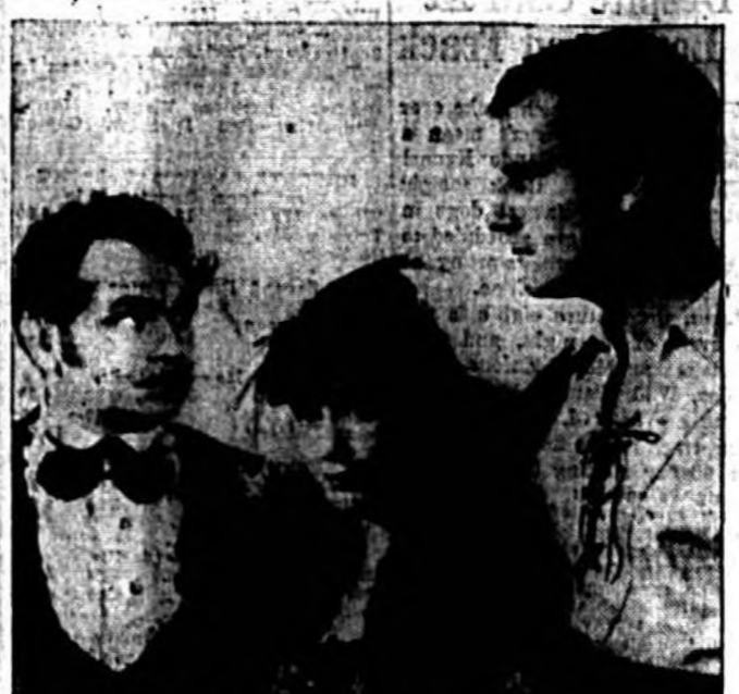
Edward G. Robinson, Miriam Hopkins and Joel McCrea form an almost tragic triangle in Samuel Goldwyn's "Barbary Coast," released through United Artists and currently at the Milane Theater.