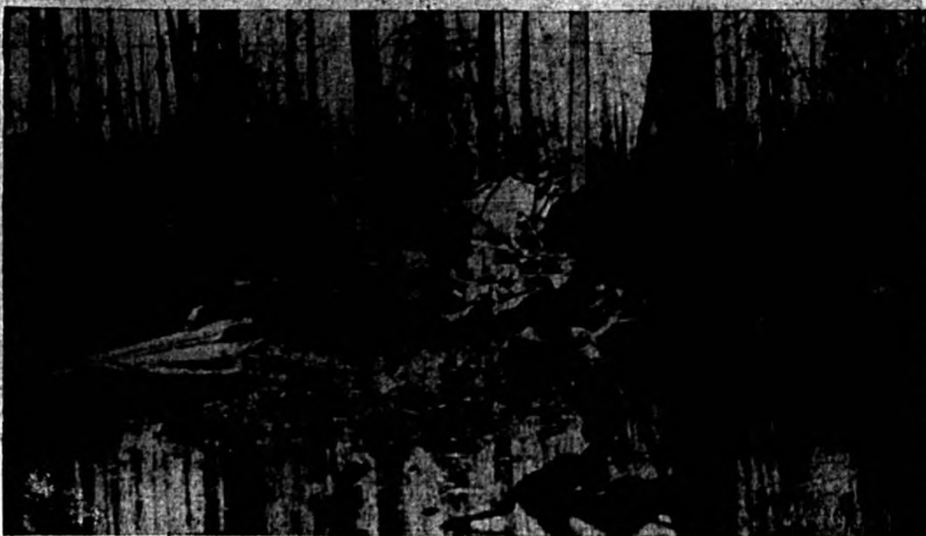
Half-buried in the wooded swamps, this wreckage is all that remains of the patrol airliner, "The Southern," in which 37 persons lost their lives when it crashed near Goodwin, Ark. Bodies and bits of the plane were strewn over hundreds of yards as the airliner crashed through the trees. Grieving relatives and friends encountered great difficulty in identifying the mutilated bodies.