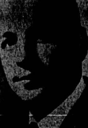
ALBERT Brewer, newly elevated to governor of Alabama with the death of Lurleen Wallace...

WASHINGTON (AP) - The labor ministry... 20,000 Reserves To Duty Today: Labor ministry news.