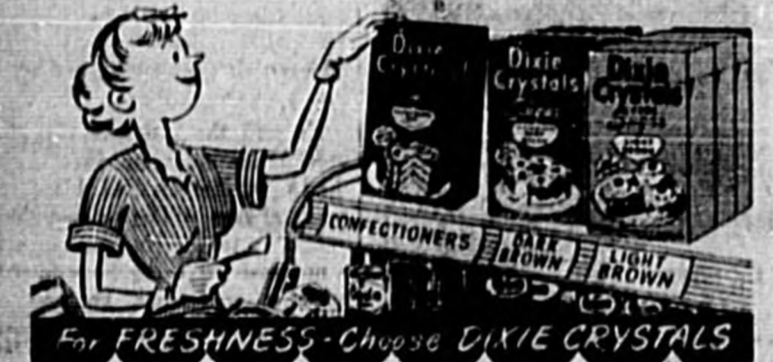
For FRESHNESS—Choose DIXIE CRYSTALS

JALOUSIE, NORMAN METAL AWNING CO., Small deposits—25¢ inc. to pay