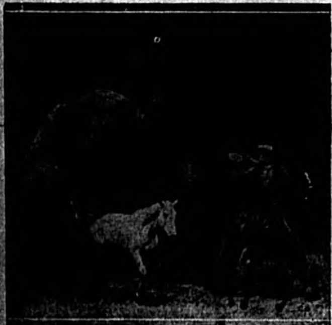
TIM HOLT, loveable youngster who is the son of Jack Holt, stars in "Cyclone on Horseback," coming to the Ritz next Friday and Saturday. Marjorie Reynolds and Leo "Lasses" White head a fine supporting cast.