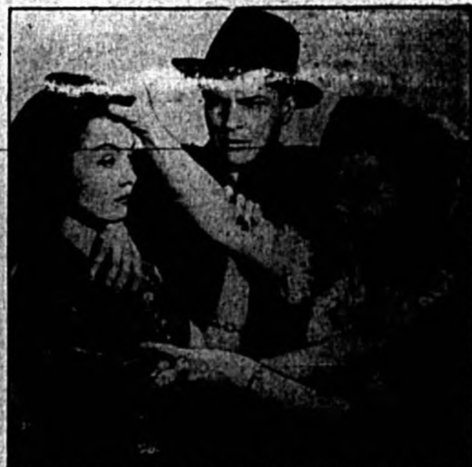
STARTLING EXPOSE of a new racket, "Under Age" will be part of a double bill at the Ritz next Tuesday. Nan Grey, Alan Baxter and Tom Neal head the cast.