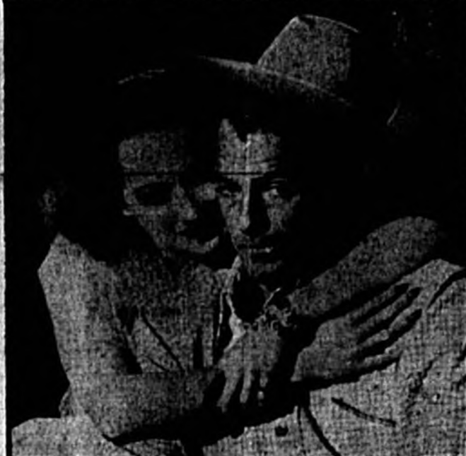
THE OLD favorite portion of the Tuesday double program scheduled for showing at the Ritz brings Gary Cooper and Merle Oberon back in the "The Cowboy and the Lady" in which Gary gets a rather snooty bunch told, and how!