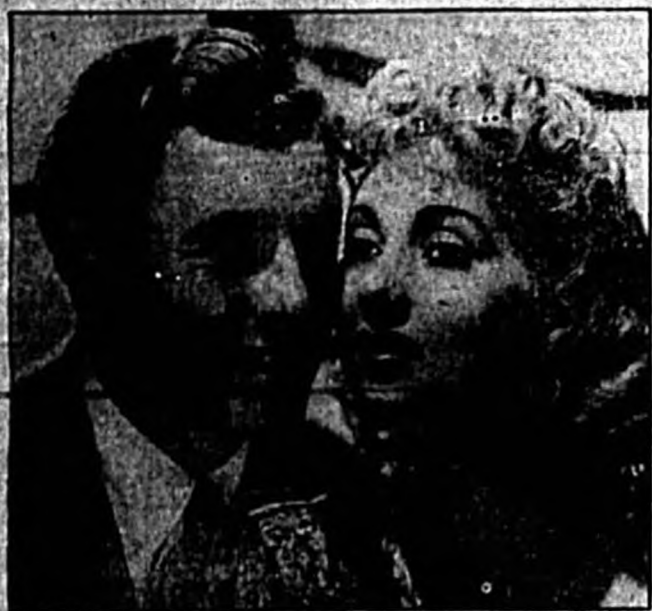
MAISIE'S NEW romance—Ann Sothern has a new romance in her latest M. G. M. starring film, "Ringside Maisie." George Murphy plays a fight manager. The film will be shown at the Ritz next Wednesday and Thursday.