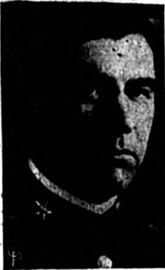
Lieut. Gen. Walter Krueser

MIXED DRINKS AT POPULAR PRICES Just A Couple Minutes' Drive on Lakefront Blvd.