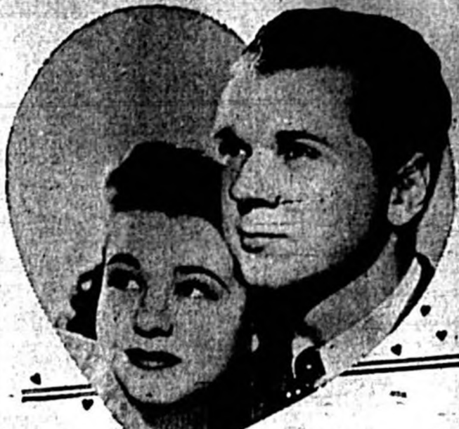
JANE WITHERS and Jackie Cooper are shown above in a scene from "Her First Beau" to be shown next Friday and Saturday, in the Ritz Theater. A fine cast, including Edith Fellows, William Tracy, Una O'Connor and Addison Richards, appears in support.