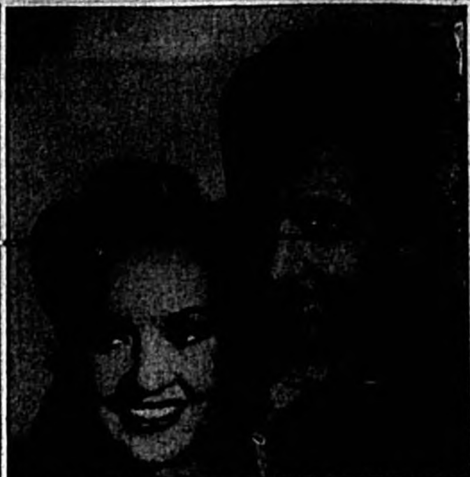
"MOON OVER MIAMI", featuring Don Ameche, Betty Grable and Robert Cummings, will bring glamorous nights and carefree days to those who see it, at the Ritz tomorrow and Monday. The film is in technicolor.

Sunday, Monday—"MOON OVER MIAMI", in technicolor, with Don Ameche, Betty Grable, Robert Cummings, Charlotte Greenwood and Jack Haley. Also—"PETE SMITH SPECIALTY," "STANGER THAN FICTION" and Metro News. Tuesday, Bargain Day, double bill—"UNDER AGE" with Nan Grey, Alan Baxter and Tom Neal. Also—Old favorite returned: "THE COWBOY AND THE LADY" with Gary Cooper and Merle Oberon. Wednesday, Thursday—"RINGSIDE MAISIE" with Ann Sothern, George Murphy, Robert Sterling, Jack LaRue, and Maxie Rosenbloom. Also—Andy Clyde Comedy and Universal News. Friday, Saturday—"CYCLONE ON HORSEBACK" with Tom Holt, Marjorie Reynolds, Ray Whitley and Leo "Lasses" White. Also—"HER FIRST BEAU" with Jane Withers and Jackie Cooper. Midnight Show, Sat. Aug. 30—"KING OF THE ZOMBIES" with John Archer, Hek Purcell, Joan Woodbury and Mantan Moreland. Also—"LOVE AT FIRST FRIGHT," screen snapshot and cartoon.