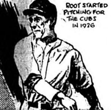
CHARLIE ROOT, 42 YEARS OLD, THE OLDEST PLAYER IN ACTIVE SERVICE IN THE MAJORS.

ROOT STARTED PITCHING FOR THE CUBS IN 1926