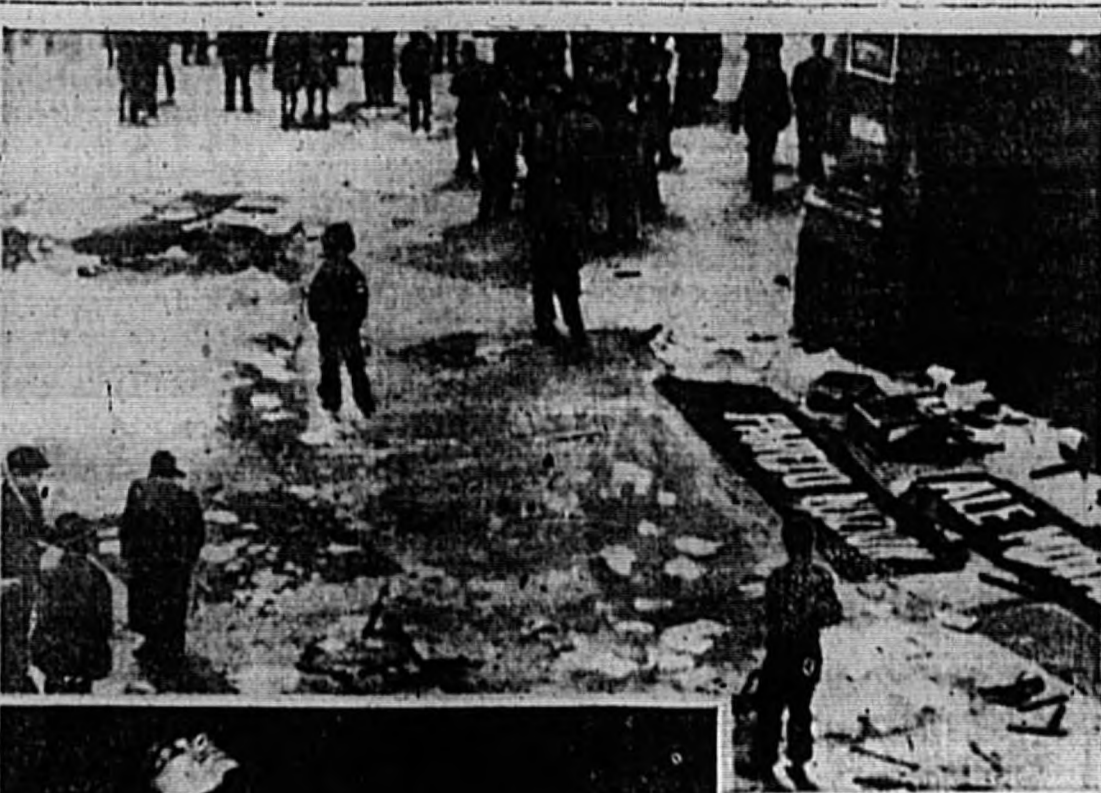
BURNED RIGHTIST newspapers litter the street (above) outside monarchist headquarters in Naples, Italy, after Communist rioters had sacked the building and smashed its sign on the pavement. At left, a worker who was killed during rioting in Milan, is covered by a partisan division's colors as he lies in a factory. Political violence in several Italian cities is reported to have brought death to nine persons in nine days. In Rome, Communist leader Palmiro Togliatti is said to have arranged a meeting of Leftist leaders to force out the DeGasperri regime.