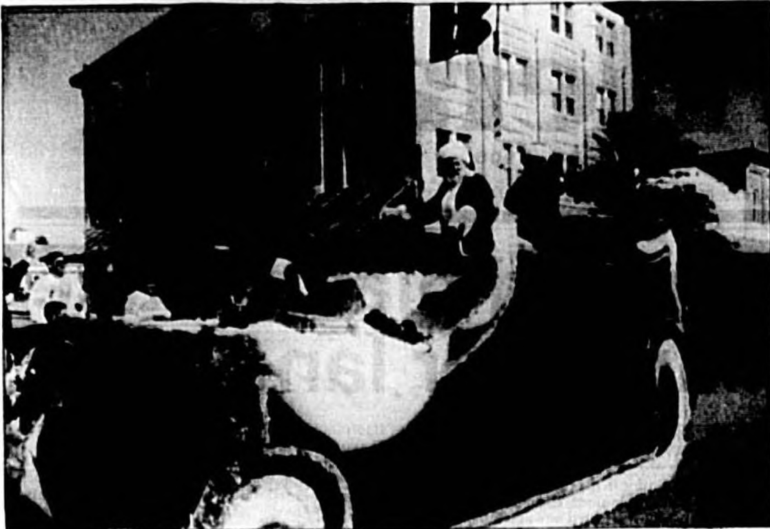
Santa's sleigh led the way down First Street, in a trial run for the big ride later this month. Not to be outdone,