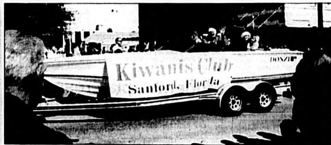
The Kiwanis Club of Sanford motored in the parade, a Donzi speed boat for a sleigh.