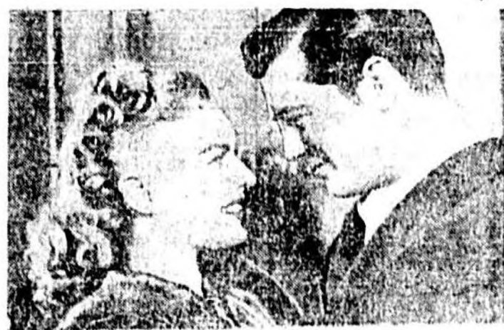
June Haver and Gordon MacRae in a romantic scene in "The Daughter of Ryan O'Grady" at the Grand Theatre, showing on the Riviera from Sunday and Monday.