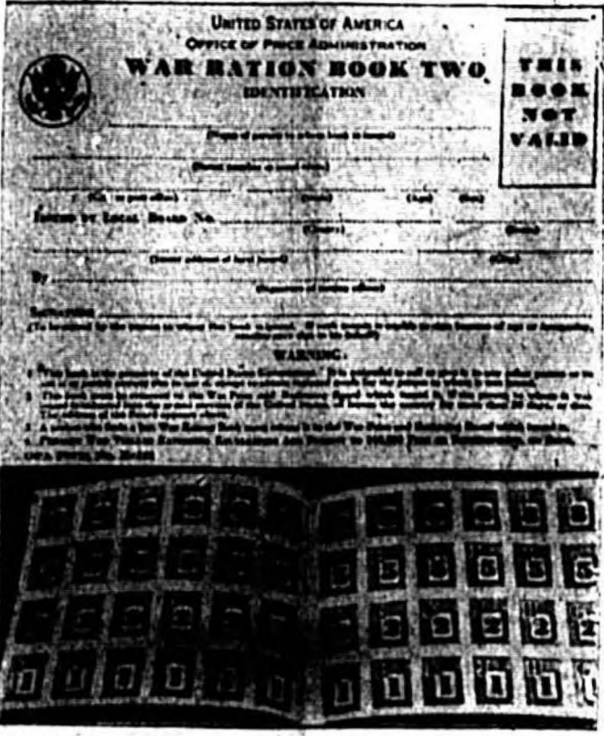
This is the front cover of War Ration Book Two (1942) designed to handle the rationing of any article as soon as a critical shortage appears. According to the Office of Price Administration the printing of these books will start immediately and will be in the hands of the public by the first of the year. The eight-inch pages of the new ration book will contain coupons which bear in a number of a letter (bottom). Half the pages are colored red and half green.