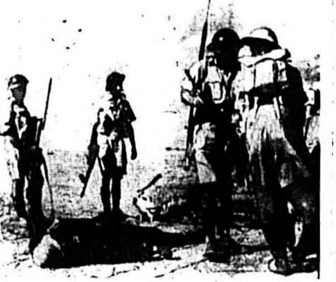
Victim Of New Allied Egypt Drive