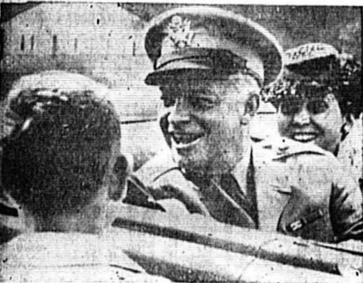
BACK FROM CHINA, where he conferred with Gen. Marshall and Gen. Chiang Kai-shek, Gen. Dwight Eisenhower lets go with his famous smile when a young admirer in Savannah, Ga., comes up to greet him and Mrs. Eisenhower. Gen. "Ike" stopped the car to say "hello."