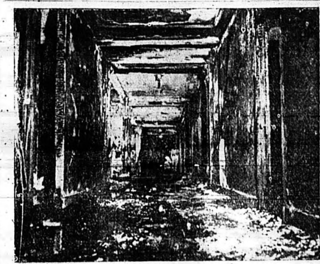
HERE IS A GENERAL VIEW OF THE GUTTED HALLWAY OF the 22-story LaSalle Hotel in Chicago. At least 51 persons died in the hotel fire, worst in Chicago's history. Approximately 200 persons including 30 firemen were overcome by smoke or suffered burns and injuries.