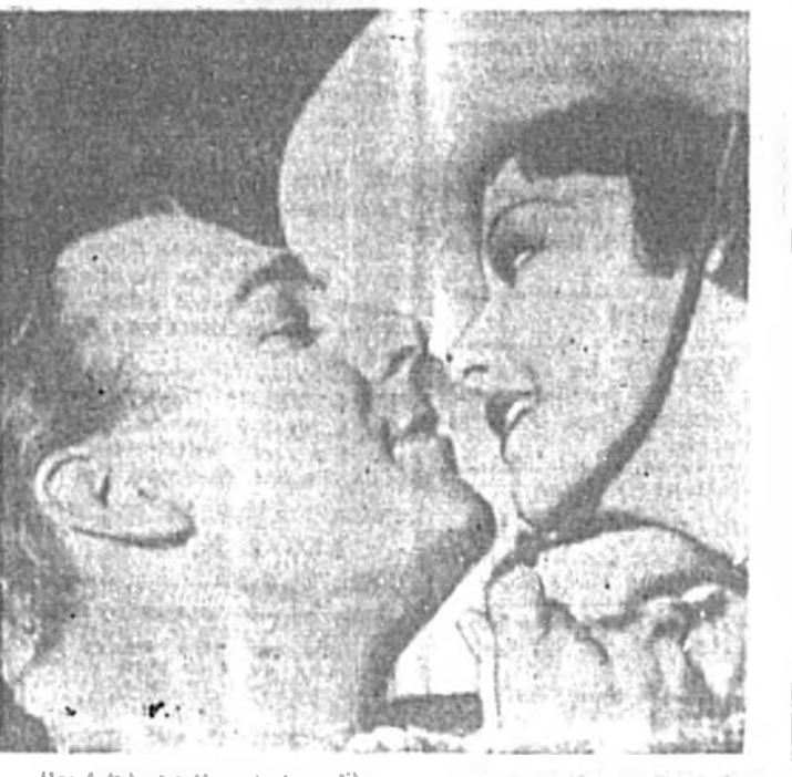
Handsome [Name] and Ann [Name] were seen together in the [Name] restaurant. The couple was seen walking together in the [Name] park.

Handsome [Name] and Ann [Name] were seen together in the [Name] restaurant. The couple was seen walking together in the [Name] park. The couple is believed to be in a romantic relationship.