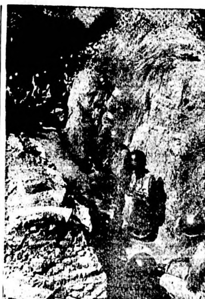
NATIONALISTS READY FOR RED ATTACK —Nationalist Chinese infantrymen take an alert position on Kinmen Island, a Ching Kai-shek stronghold off the Red China mainland. The Nationalists reported they repulsed two invasion attempts by Communist forces aiming at the capture of the off-shore Quemoy Islands.

PARIS (UPI)—Police and troops with "shoot on sight" orders engaged rebels and all installations in major French cities today to prevent new raids by Algerian Terrorists who bombed and burned all installations and shot up the streets Monday. No fresh attacks during the early hours today. Seven persons died in Monday's violence. As dawn broke police and troops tightened security precautions. Guards had orders to shoot suspicious characters on sight. Steel helmeted police armed with automatic guns patrolled the industrial suburbs of Paris. The rampage by "commandos" of the rebel National Liberation Front was the worst since the start of the Algerian revolt for independence began nearly four years ago. It was believed the Algerian rebels were seeking to bring home to the French public their hostility toward Premier Charles de Gaulle's proposed new constitution, which makes no provision for Algerian independence. France votes on the constitution in a referendum Sept. 28 and De Gaulle is touring French possessions in Africa in build up support for his pet project.