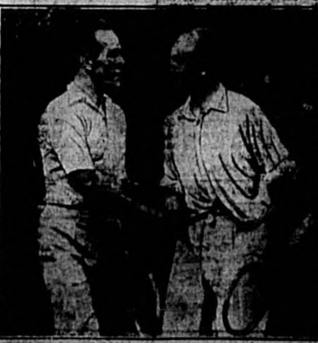
Henri Cochet (France), left, congratulating Nigel Sharpe (England) at Wimbledon, England, after the French star was defeated by his English rival during the first day of the championships in a match which caused a sensation in the tennis world.

You'll SEE the difference You'll FEEL the difference You'll ENJOY the difference Drive a CHRYSLER