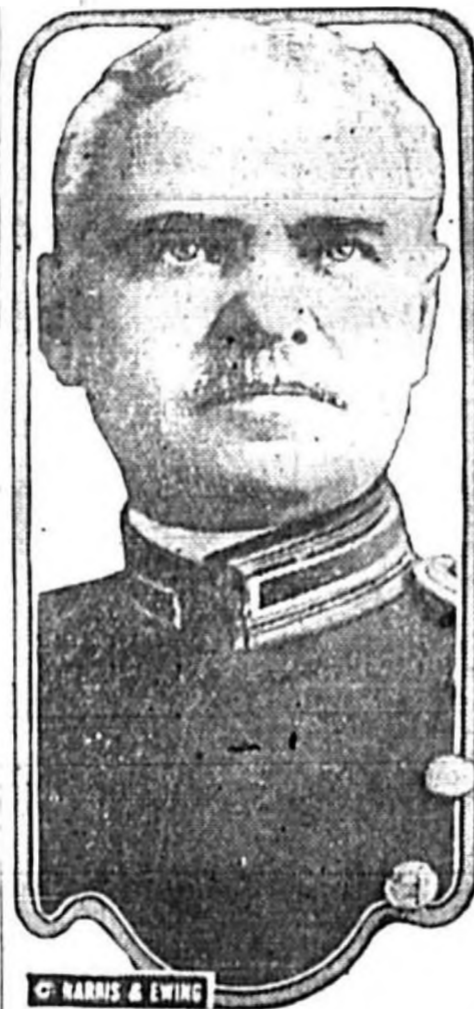
Col. George W. Goethals.

Ferdinand de Lesseps, the builder of the Suez canal, formed the Inter-oceanic Canal company in Paris in 1877 and actual work on the canal was started in the next year. On January 20, 1889, the de Lesseps company, in the pres-