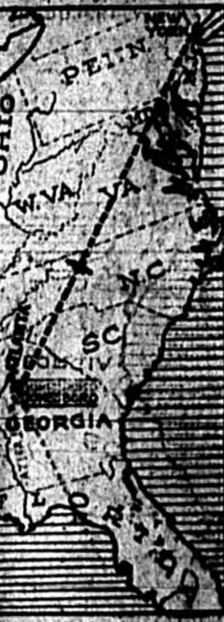
This map shows the route from New York to the Eastern Air Lines plane which crashed near Jacksonville, Fla. The plane was bound for Atlanta, but apparently overtook its mark. Then, turning back, it crashed into the woods.