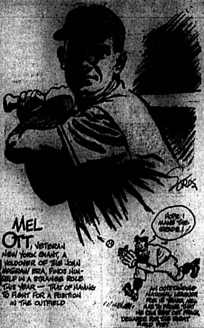
MEL OTT , VETERAN NEW YORK GIANT, A HOLDOVER OF THE JOHN MCGRAW ERA, FINDS HIMSELF IN A STRANGE ROLE THIS YEAR - THAT OF HAVING TO FIGHT FOR A POSITION IN THE OUTFIELD.