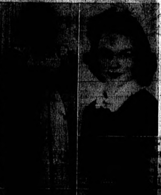
Palatka, Mar. 4 (Special)—Junior Chambers of Commerce from Andalusia, Ala., and Tampa and Daytona Beach...

One hundred per cent respect of civil rights is what labor's... 'I am not a Communist...'