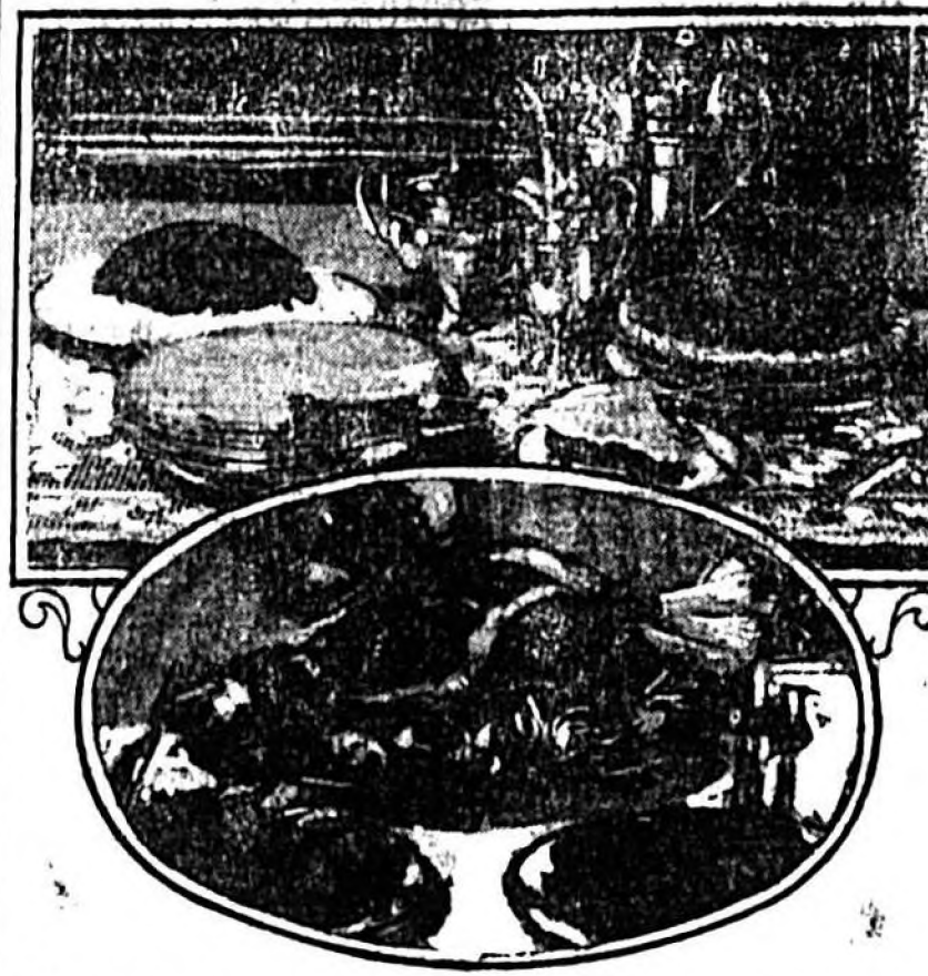
A Typical Thanksgiving Table. (Below) The noble bird which forms the piece de resistance of the Dinner

Enough fresh Bread Crumbs to make one cupful when moistened with 1/2 cupful Milk. Cream the Crisco and sugar, add egg yolks well beaten. Add the bread crumbs when cool. Then the fruit juice and fruit. Sift together remaining dry ingredients and last stir in egg whites beaten stiff. Put in greased mold, cover and steam five hours in covered steamer over kettle of hot water. Fill mold only three-quarters full to allow for rising while steaming.