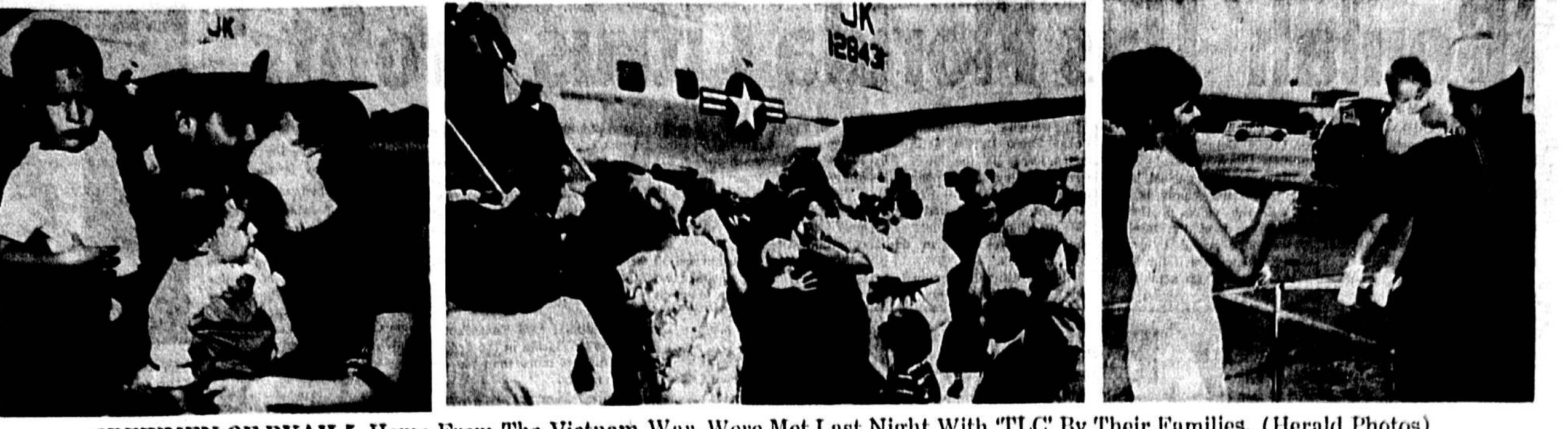
CREWMEN OF RVAF-5, Home From The Vietnam War, Were Met Last Night With 'TLC' By Their Families.