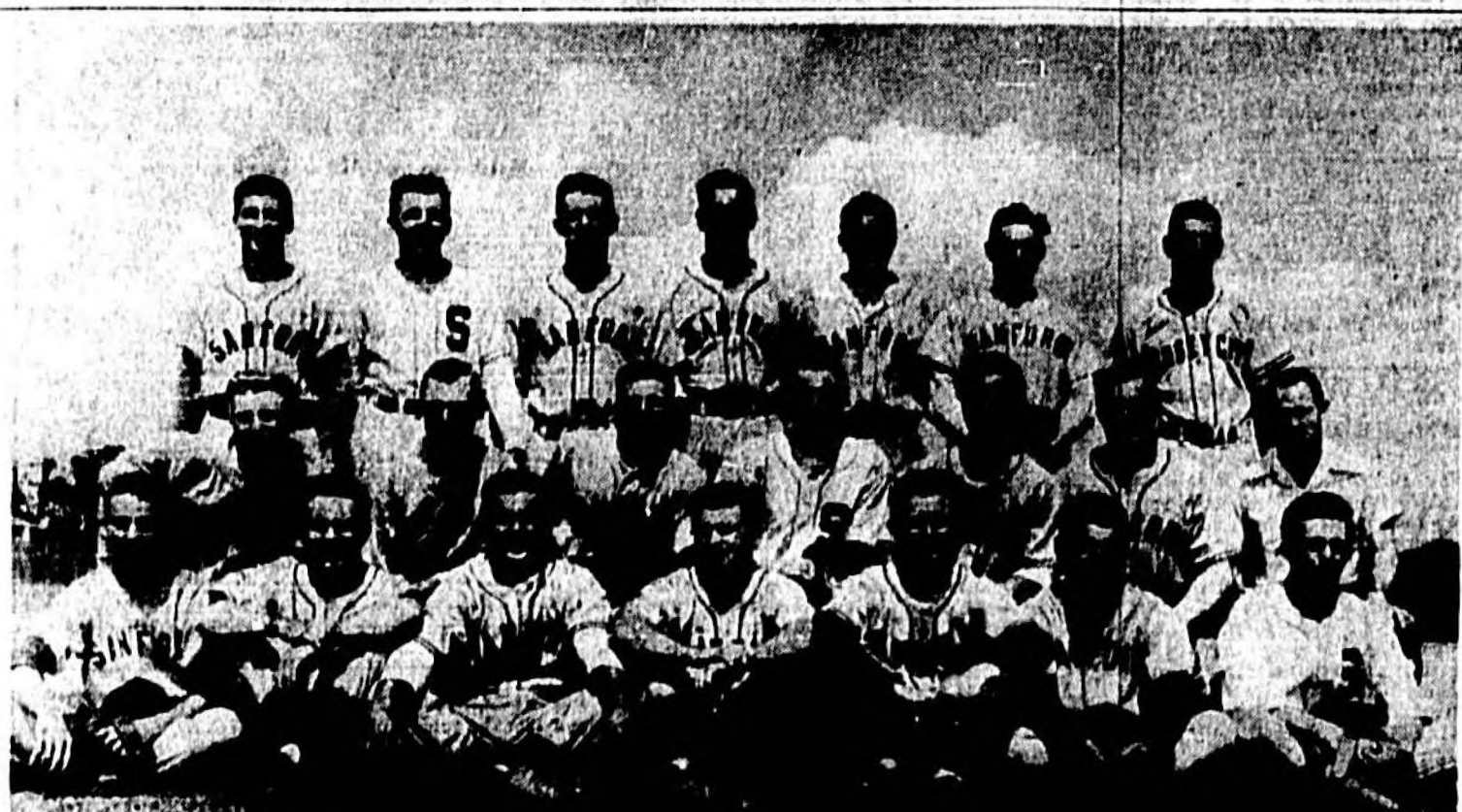
The Sanford Giants grin happily before taking to the field against St. Augustine in a Sunday afternoon tilt...