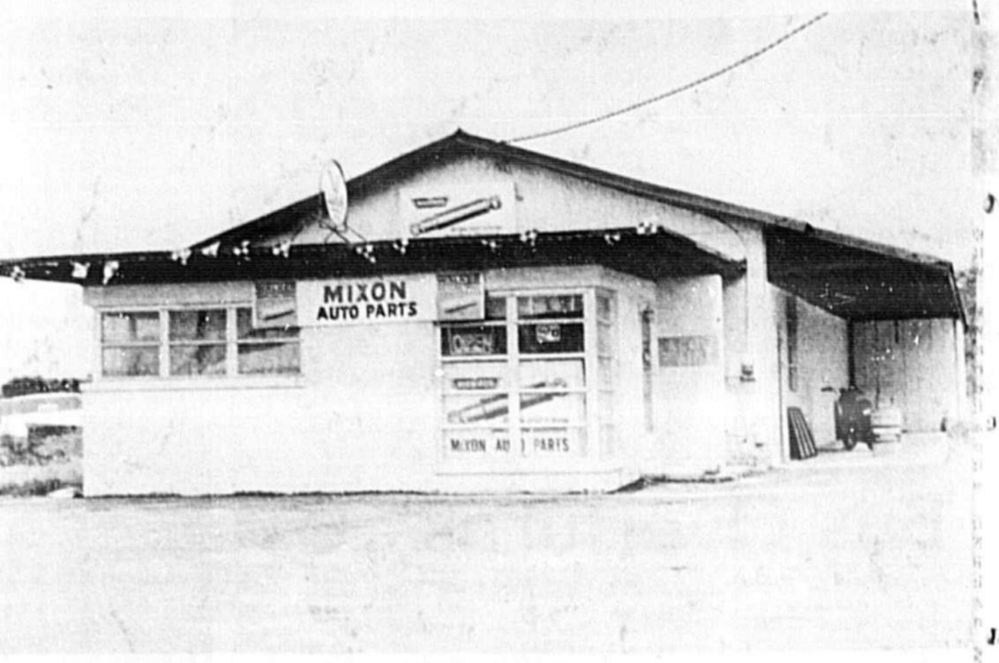
MIXON AUTO PARTS